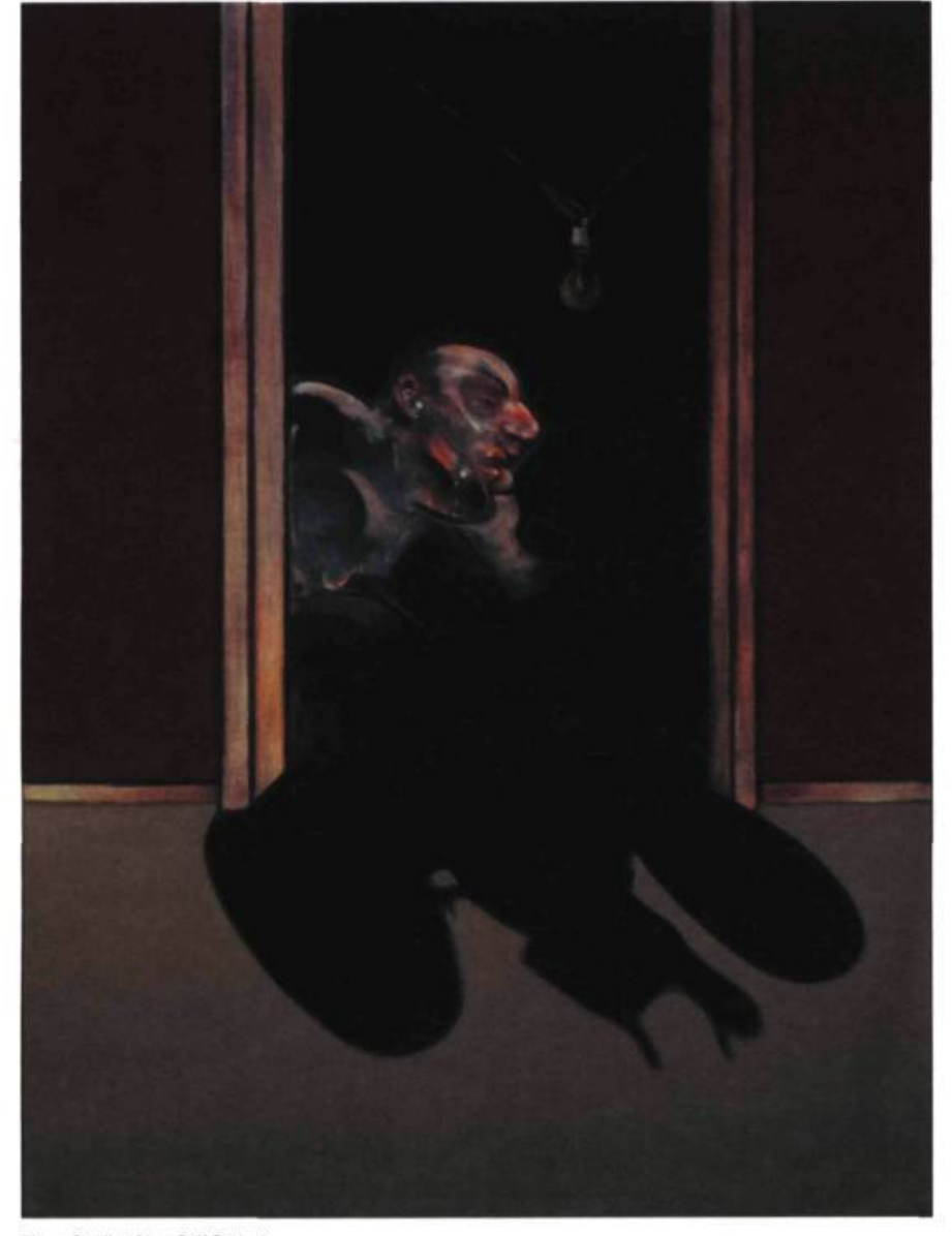
Three Studies for a Self Portrait (middle panel of triptych), May-June 1973 Private Collection Switzerland © Estate of Francis Bacon. All Rights Reserved, DACS 2007

section is a world onto itself, a mini exhibition within the framework of a large one.