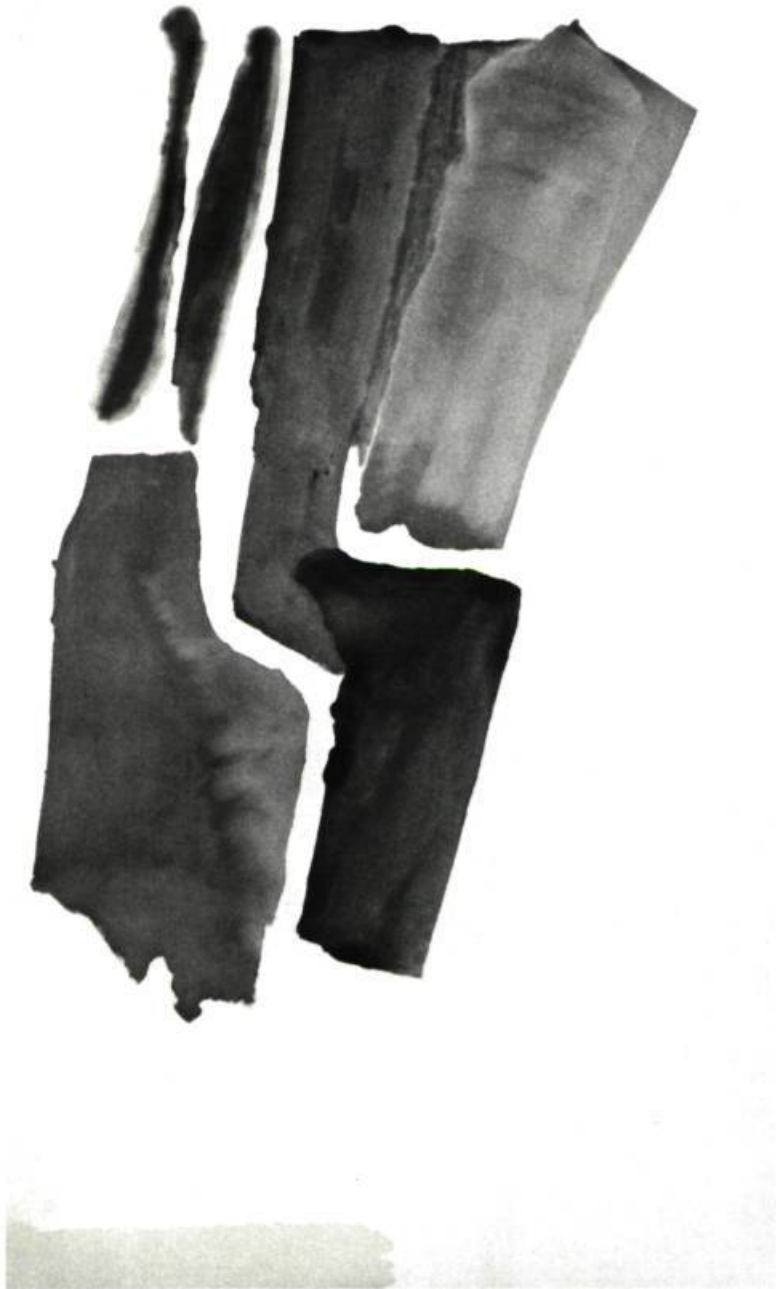
helen frankenthaler (1928 - ) yellow-south west , 1969. acrylique sur toile; 96 po. sur 48 (243,9 x 123,85 cm.).

new-york, andré emmerich gallery.