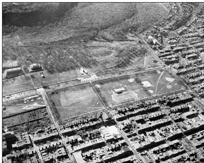
Figure 1. Aerial photograph taken on 25 October 1956. Sectioning the image from left to right is Park Avenue; above Park is the area of Mount Royal Park known as the Jungle, below is Fletcher’s Field.

The very existence of the Jungle contravened the original design and intentions of Mount Royal Park’s landscape. Indeed, it is