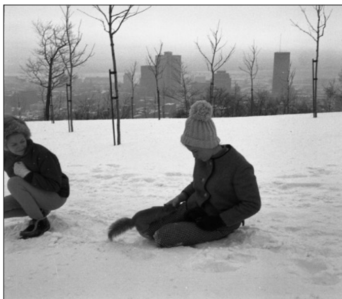
Figure 8. Deciduous trees in the background illustrate the abundance of newly planted Norway maples on Mount Royal on 26 January 1965.

on St-Joseph Boulevard and Pie IX Boulevard had supplied earth fill for the Mountain, ensuring soil supplies for planting and growing areas in the park to make it “proper for nicer-looking trees” 104 —a step away from the transitory resinous trees used to rehabilitate the park. With this soil supply the park could therefore enter a phase of rehabilitation and “beautification” by planting more aesthetically impressive species. Montreal planted more trees than any city in the world in 1960. 105 By 1964 the forestry division began planting wide-ranging types of trees, Norway maples and silver maples, pines, spruce, oak, ash, and elm trees, for a total of 8,500 that year. 106