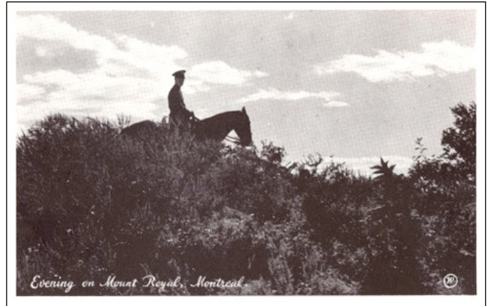
Figure 2. This postcard conflates the notion that evenings and nights in Mount Royal Park demand vigilant mounted police officers near the underbrush.

Un incident récent a montré jusqu'à quel point la surveillance laisse à désirer sur le mont Royal. Un étudiant de l'Université McGill y est