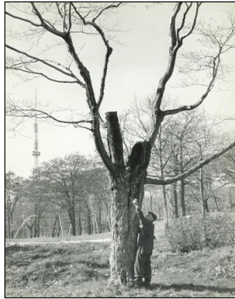
Figure 4. An employee of the city's forestry division analyzes the decrepit state of a tree in autumn 1960. Trees in such a state were numerous at the time in Mount Royal Park. Source: Dumont, Rapport relatif à l'état actuel de la végétation du Mont-Royal, FAB, AUM.

Nevertheless, the MPPA's comment reveals that they did not wholly reject plans for Mount Royal. Indeed, the Jungle aside, the ecology of Mount Royal Park had been progressively deteriorating. As sources reveal, little attention was given to the park's ecological well-being in the 1940s and 1950s. As Jean-Joseph Dumont, superintendent of the Montreal Parks Department's Forestry Division, stated in 1956, sections of Mount Royal Park had degraded with such rapidity that, according to him, within a decade the park would become unserviceable to Montreal's culture. 66 His statement in fact conveyed Mount Royal Park's role as a tool of cultural betterment for Montreal's citizens, and the fact that this "cultural" institution had suffered from the municipal government's poor planning. Dumont envisioned Mount Royal Park as a naturally densely wooded forest. When the clearance of the Jungle became a prominent issue, park advocates demanded that authorities include a restorative strategy for Mount Royal Park's whole ecology, a plan that partnered well with the proposed development of the Jungle. This way the authorities would respond to two perceived needs in Mount Royal Park: clearance of the Jungle and cutting down dead or dying trees (figure 4), while preserving a clear Romantic aesthetic landscape.