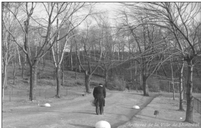
Figure 3. This snapshot was part of a photographic report produced on 18 November 1953, Parc du Mt Royal: Différents paysages. The report depicts various users and aspects of the park, notably hikers, squirrels, and patrons in the chalet's restaurant.

people who helped the police department catch “dangerous criminals” through a system of honorary police membership. By inciting citizens to partake in vigilantism and capture criminals, the city was not only fabricating a proactive policing stance, but more importantly, elaborating a greater distinction between the Same and the unfamiliar Other. 30 Regardless, these preliminary tactics did not satisfy individuals who devotedly sought a safer, cleaner, and more tranquil park.