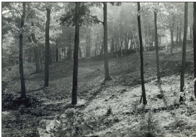
Figure 5. Ground view of Mount Royal after the Morality Cuts in autumn 1960; notice the sparse trees and nearly non-existent underbrush.