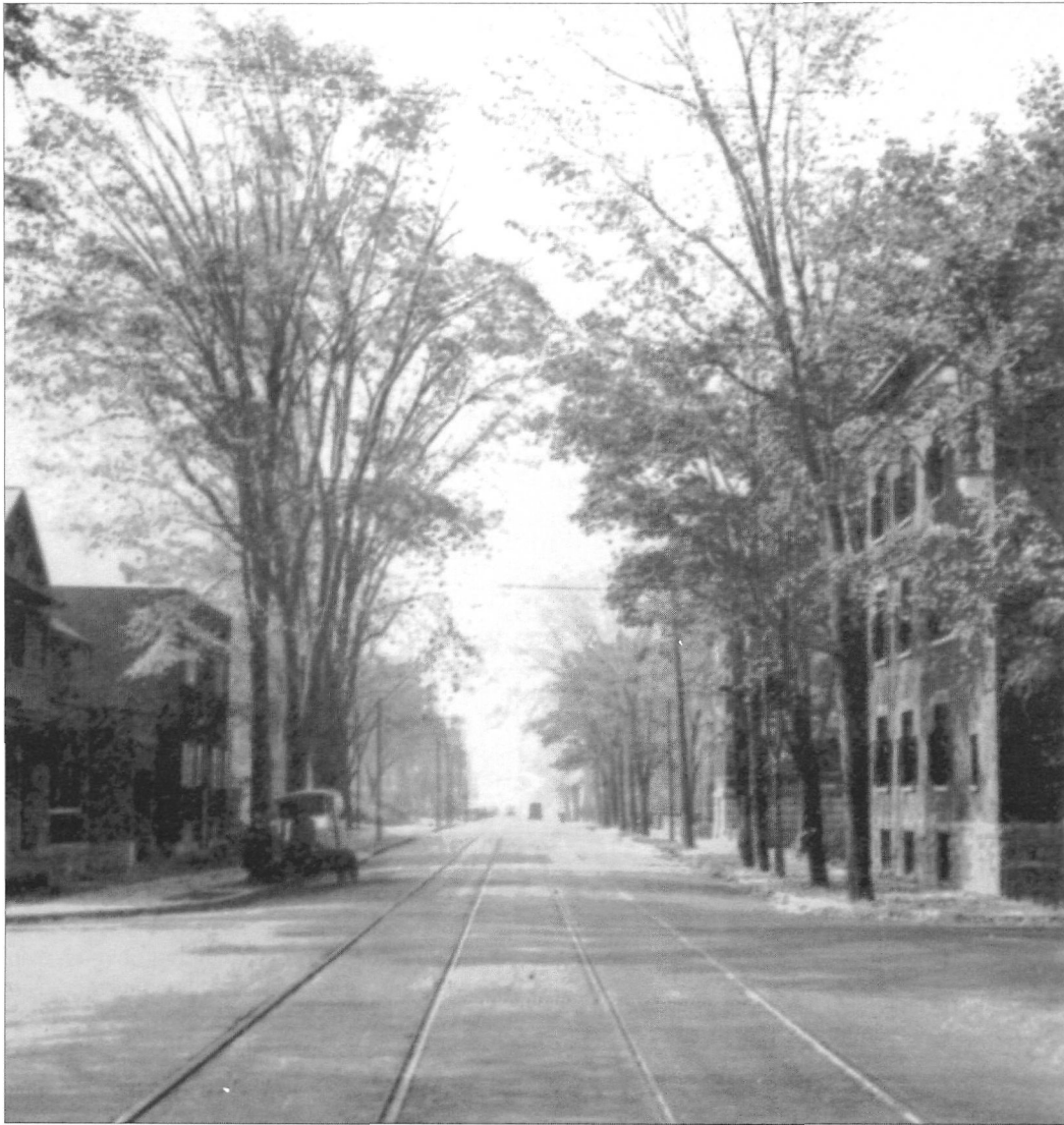
Figure 7: Laurier Avenue, circa 1948. This is one of a series of photos taken for the Greber Report that emphasize the beauty of street trees and demonstrate their role in disciplining an uneven streetscape.

Greber Report. 251. © National Capital Commission / Commission de la capitale nationale. City of Ottawa Archives, CA 4079