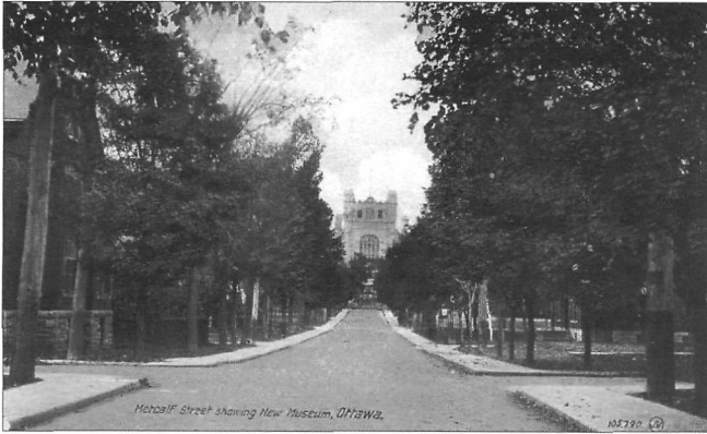
Figure 2a: Metcalfe Street, circa 1913

Postcard titled, "Metcalfe St. showing new museum"