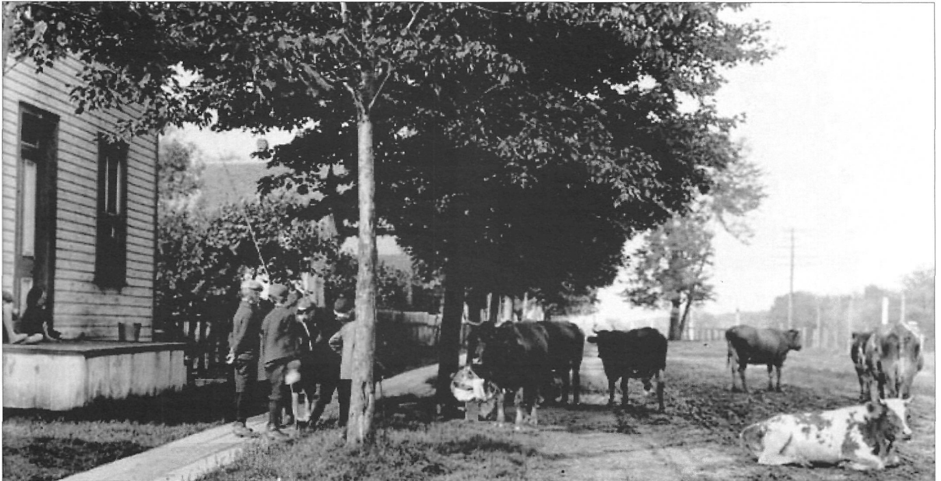
Figure 3: Harvey Street, 1903. Many early street trees were located in the boulevard between the unpaved street and plank sidewalk, a setting conducive to healthy growth, as this photograph shows. Note the damaged bark on the first tree. An 1869 bylaw called for a fence to protect saplings from horses (and presumably, cows); the 1890 bylaw called for a wooden box. This street was still just outside city limits in 1903.