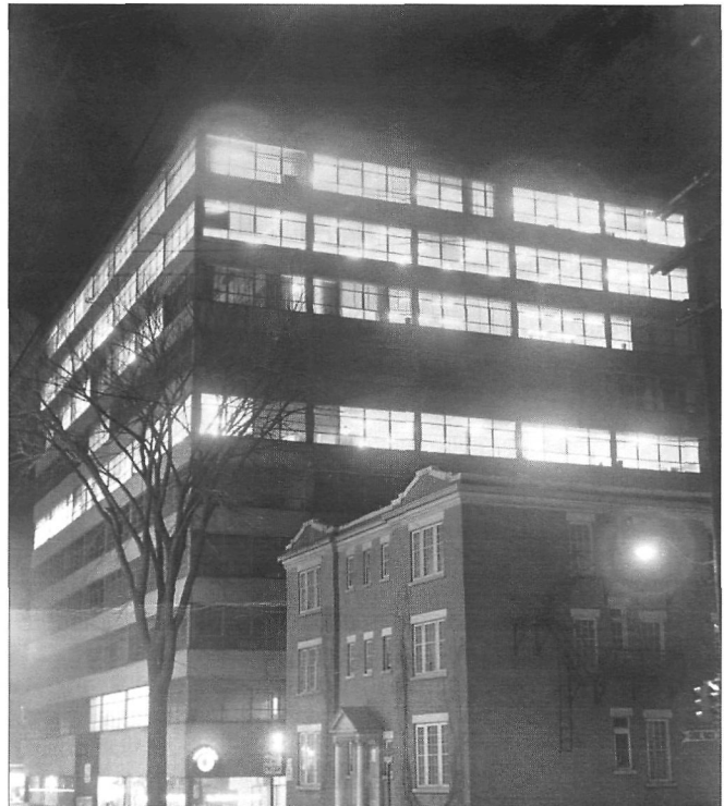
Figure 2d: Metcalfe Street, 1956.