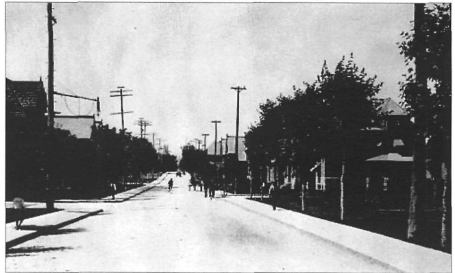
Figure 2b: Metcalfe Street, n.d.

Postcard titled, "Metcalfe St. showing new museum"