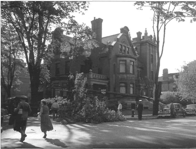
Figure 2c: Metcalfe Street, 1954. Note the fallen tree.