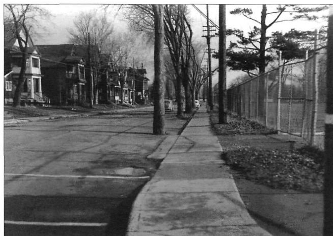
Figure 5: Fifth Avenue, n.d. Boulevard trees were particularly vulnerable when city streets were widened and paved with asphalt.