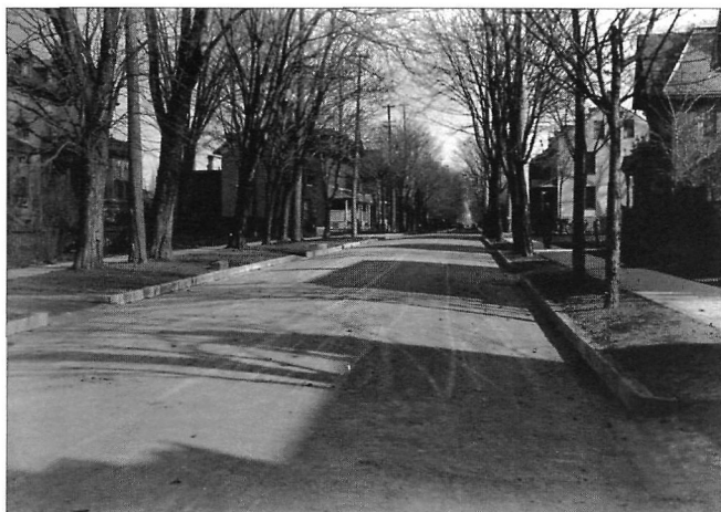
Figure 4: Daly Avenue, 1903. The City of Ottawa experimented with new tar macadam and curbing along Daly Avenue in 1903. By 1939 over 130 kilometres of streets were paved with asphalt or tar macadam; these impervious surfaces blocked water from tree roots.