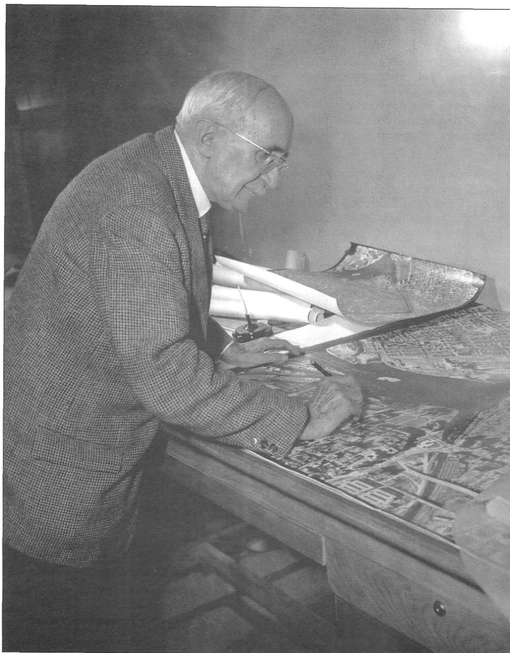
Figure 3: Jacques Gréber at work on aerial photographs of Canada's capital, ca.1955.