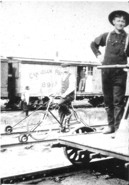
Figure 7. Bicycle modified to run on railway track. Winnipeg, c 1910. (WCPI).

Saphron's Drug Store and, during the Christmas season, for Oretsky's Department Store, helping out their full-time bicycle delivery boy. 58