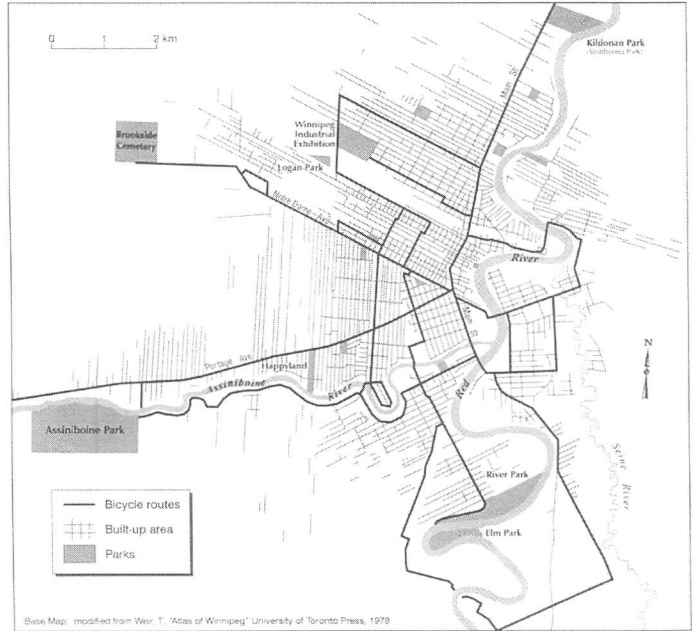
Figure 3. Winnipeg's bicycle path system c. 1905 (Compiled from Winnipeg Public Parks Board, Summer Outings 'Round Winnipeg, 1906).