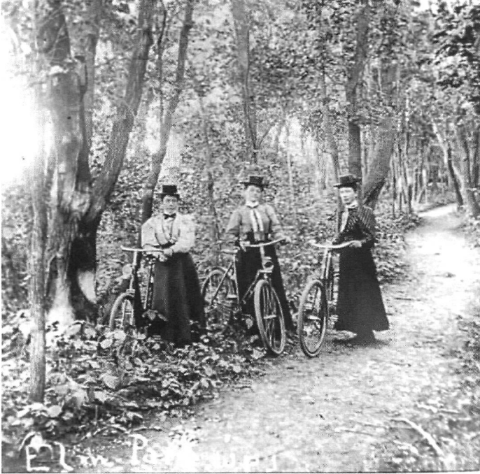
Figure 2. Women cyclists in Winnipeg's Elm Park, ca 1908.