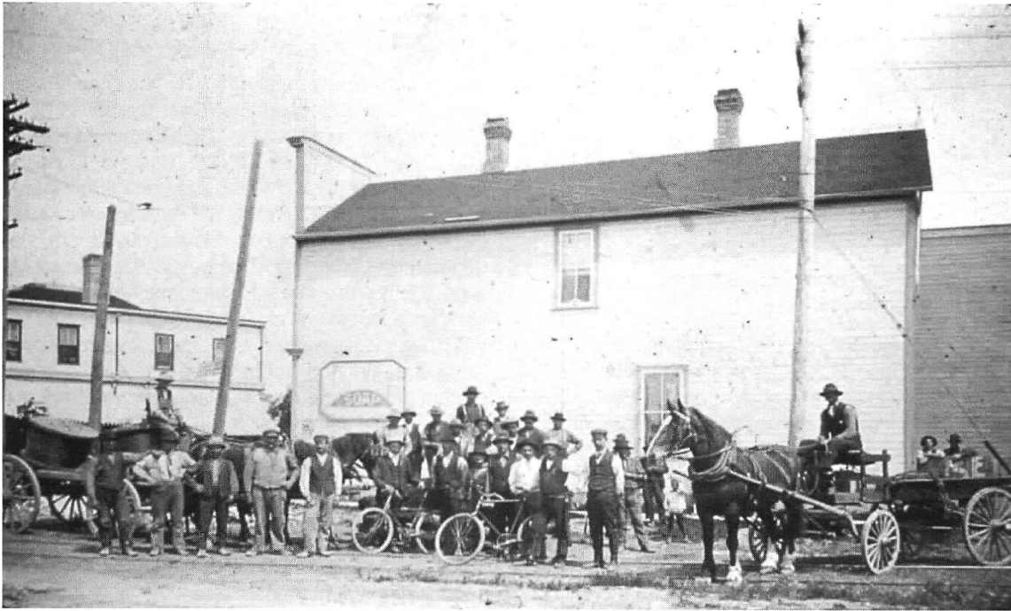
Figure 6. Manitoba Government Telephone System workteam with their cycles c. 1910.