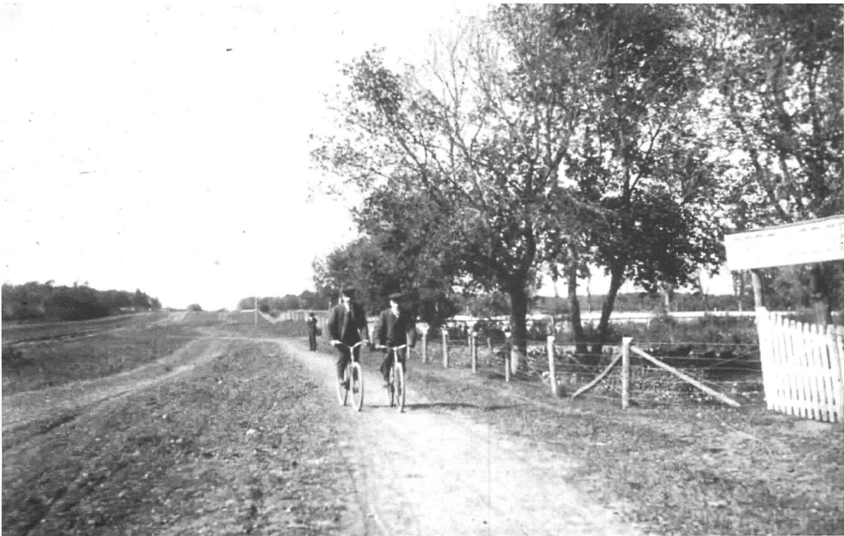
Figure 4. The Portage Avenue Bicycle Path at Deer Lodge. c 1905 (WCPI)