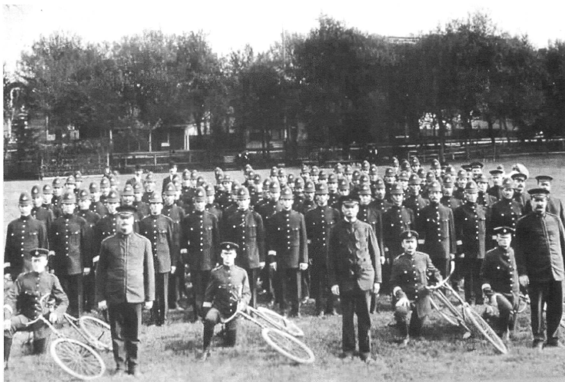
Figure 8. Winnipeg police supervisors used bicycles to monitor their patrolmen. (WCPI).

It has been claimed that the bicycle craze literally paved the way for the automobile by popularizing the cause of well-paved roads and highways. 68 Presumably this claim could be made on behalf of Winnipeg's cyclists too, since the locally influential Town Topics editorialized on the role that the cycle was playing in educating Winnipeggers about the value of good roads. 69 Nevertheless, there is no direct evidence that the massive programme of street paving undertaken in the city in the late 1890s