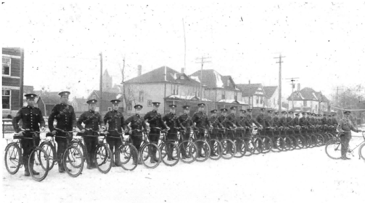
Figure 9. Fort Garry Horse Bicycle Troop, c. 1915.