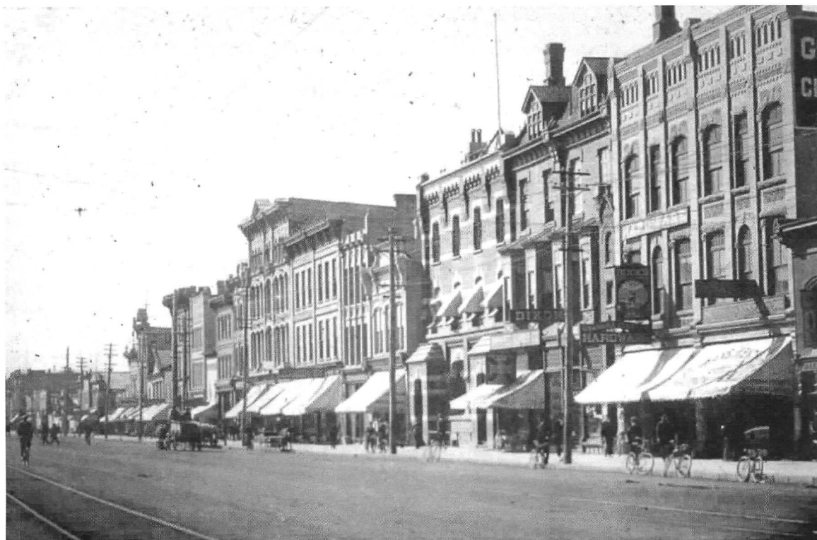
Figure 10: Before the automobile became a common sight bicycles were the common vehicle of choice parked along Winnipeg's downtown streets. (WCPI)