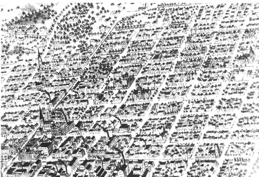
Figure 3: 1893 bird's-eye view of Hamilton (detail) showing the elite Durand neighbourhood to the southwest of the city centre. Note the relative uniformity of house size and style. Some of the city's finest churches are seen here including St Paul's Presbyterian Church at the corner of James and Jackson Streets (see Figure 12).