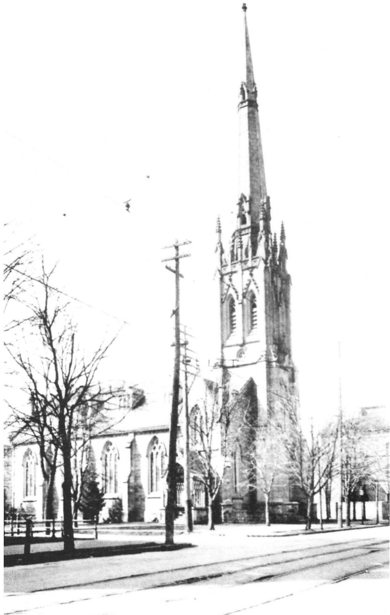
Figure 12: St Paul's Presbyterian Church. Built in the 1850s, this edifice is one of Hamilton's most outstanding structures. The spire is regarded as the finest in Canada. Curiously the text of Art Work claims that "there are in the city no church edifices remarkable for size or architectural beauty." (See note 28.)

What, then, do these sources tell us about the character of Hamilton at the end of the