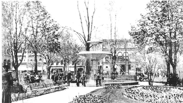
Figure 7: Gore Park as shown in Art Work . This scene is an example of the dialectic of nature in the characterizes many of the urban settings depicted in the volume.

The tone of book is vividly represented in the first photograph (see Figure 7) which depicts a sunny spring day in Gore Park in the heart of the city. Several men are seated on benches while other stand around the ornate cast-iron fountain. A woman is pushing a carriage along a walkway past some flower beds. The foliage of the trees all but obscures the buildings on James Street. This scene and similar ones symbolize the dialectic of humanity and nature presented from two perspectives: nature in the city and the city in nature.