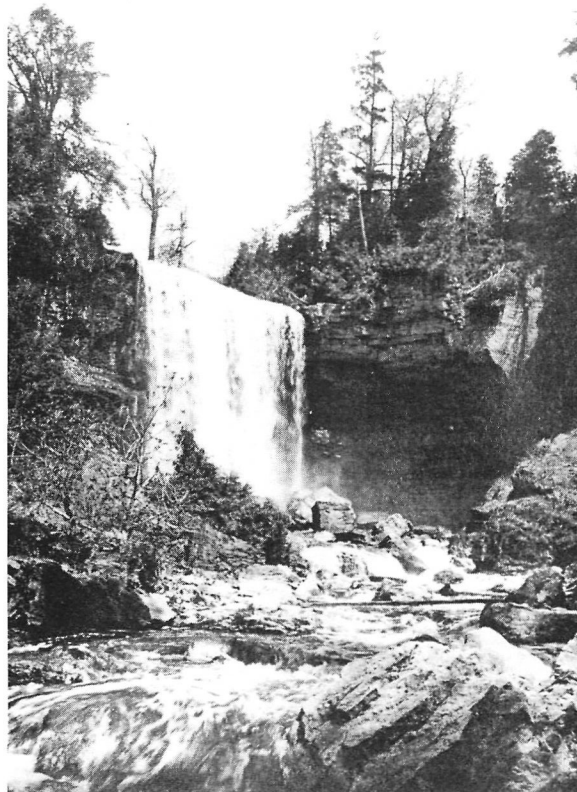
Figure 8: Webster's Falls. This is typical of views in Art Work which portray the aesthetic qualities of the natural environment in Hamilton and vicinity. There are 19 photographs of sites along the Niagara Escarpment in the book.

The photographs in Art Work are categorized in Table 3. One striking difference is immediately apparent in comparison with Table 1. Almost one-quarter of the photographs in Art Work depict non-urban settings. There are no comparable pictures in Birmingham . Further emphasis on the natural environment is apparent in the 19 scenic views of locations along the Niagara Escarpment. Figure 8, for example, portrays both the idyllic and rugged qualities of nature at Wester's Falls above the nearby town of Dundas. In describing the journey up the escarpment, Art Works notes: "The greater part of this drive (the Beckett Drive) is hewn out of solid rock. From many parts views of the city, of the lake, and of parts of the surrounding countryside are obtained, and the immediate surroundings are very beautiful in their sylvan and semi-savage rudeness." 26