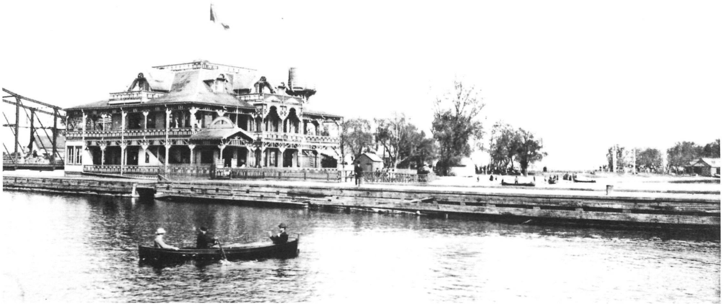
Figure 13: Royal Hamilton Yacht Club House - Hamilton Beach. This is an example of the several photographs in Art Work depicting the leisure activities of the elite. Hamilton Beach was the location of many summer cottages belonging to some of the city's wealthiest families.

19th century? Clearly all three items discussed here stand as visual evidence of the elements that comprised the city's landscape at this time. The accuracy of the evidence provided by the map can be verified in fire insurance atlases and other sources. Beyond this, however, visual sources provide evidence regarding the essence or meaning of the landscape in which individual and class experiences took place. The symbolism and meaning of Art Work , for example, could not be inferred easily (if at all) from the more traditional, quantitative sources available to the urban historian. Thus visual sources can be useful in that they enhance our understanding of past landscapes and their meanings. At a more general level these sources are indicators of the spirit of the age. As Olsen suggests, "Now that the very survival of the city has been called into question, a heightened awareness of pleasures that persist in some of them can only make us more perceptive as urban historians, more grateful as city dwellers." 31