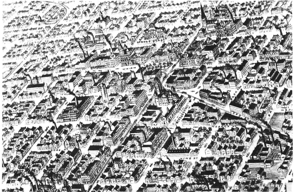
Figure 1: 1893 bird's-eye view of Hamilton (detail) showing the city's central business district with its prominent public buildings (City Hall is the largest building with the clock tower in the centre of the picture) and factories.

The most striking feature of the 1893 map is the prominence accorded to industrial activity in the city. There are more than 150 factory chimneys depicted, each releasing billowing clouds of black smoke. Other noteworthy features of the built environment include churches and public buildings. These, however, are clearly secondary to the factories. Industry was most heavily concentrated in two parts of the city - in and around the central business district (see Figure 1) and along the western portion of the waterfront near the Grand Trunk Railway yards (see Figure 2). The only area in which industry is absent is the elite residential district (now known as the Durand neighbourhood) southwest of the city centre (see Figure 3). In addition to factories, transportation facilities associated with the railways and the harbour are highly visible. The map depicts nine trains entering or leaving the city, three locomotives in the Grand Trunk yards, and nearly fifty ships in the harbour. The theme of the map, then, is the proliferation of industrial activity on the