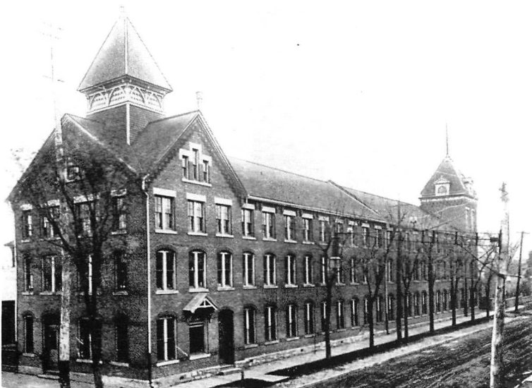
Figure 5: The Meriden Britannia Works as shown in Birmingham . Note how the roofline has been drawn in to give the building a clean, sharp appearance.

The contents of Birmingham , then, appear to echo the spirit of industrial capitalism, which also underlies the artist's rendering of the bird's-eye view map discussed above. The book clearly established the city's identity as being rooted in industry. What distinguishes Birmingham from the map is the fact that it affords a view of landscape elements from the ground. Here it is possible to examine specific elements of the landscape in much finer detail than the map allows. Of particular interest are the individual factories in Birmingham's illustrations. Goss 22 notes that buildings can be viewed as both cultural artifacts (where architecture reflects the values of a culture) and objects of value (where value is measured in terms of use, exchange, sign and symbol). Thus architecture, as a component of the landscape, has practical value as well as meaning. The manner in which individual factories are depicted is symbolic of wealth, achievement, and success for both the city as a whole and the factory owners, who were part of the newly emergent class of industrialists and entrepreneurs. Thus we can view buildings as cultural artifacts reflecting the culture of industrial capitalism.