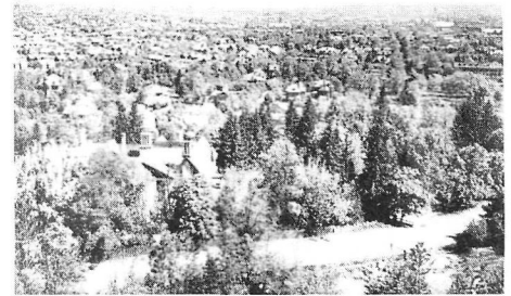
Figure 11: Bird's-eye View, City of Hamilton. This panoramic view gives virtually no indication of the city's industrial character. Inglewood (see Figure 10) is shown partially hidden by trees in the lower left of the picture.

** There are 100 photographs; two of them depict two specific buildings, each in a different category, thus N = 102.