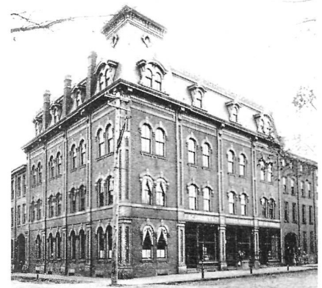
Figure 6: E. and C. Gurney and Company as shown in Birmingham . In terms of architectural style and decoration this is one of the most elaborate factories portrayed in the volume, reflecting the success of the company and its owners.