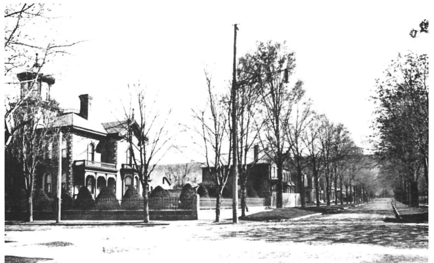
Figure 9: East Avenue from Stinson Street and East Avenue from Main Street. Several photographs in Art Work contain photographer Cochran’s personal stamp. His residence is in the centre of the bottom picture.