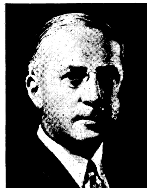
The Honourable J. L. Ilsley, Minister of Finance (Canadian Business, 1944)