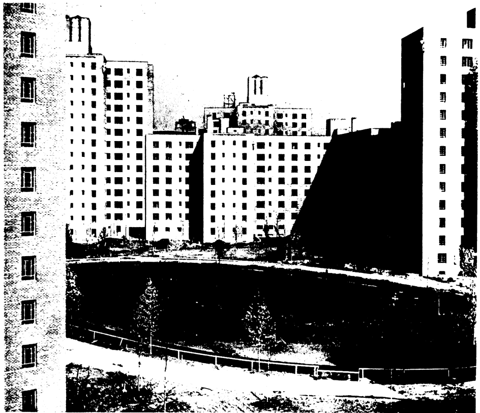
The Parkchester apartments, New York, were built by the Metropolitan Life Insurance Corporation and used by W. C. Clark as a model to encourage private capital investment in rental housing. (Architectural Forum, June 1939)

Towards the end of World War II the rigid dominance of Clark's views on housing policy came in for increasing criticism as housing shortages mounted with the return of veterans. Concern was widespread in the Department of Veterans' Affairs, the Wartime Information Board, and the demobilization branches of the armed services. Housing shortages were playing havoc with the government's efforts to rehabilitate returned servicemen. 43 The NHA's plans for limited-dividend housing continued to be fruitless.