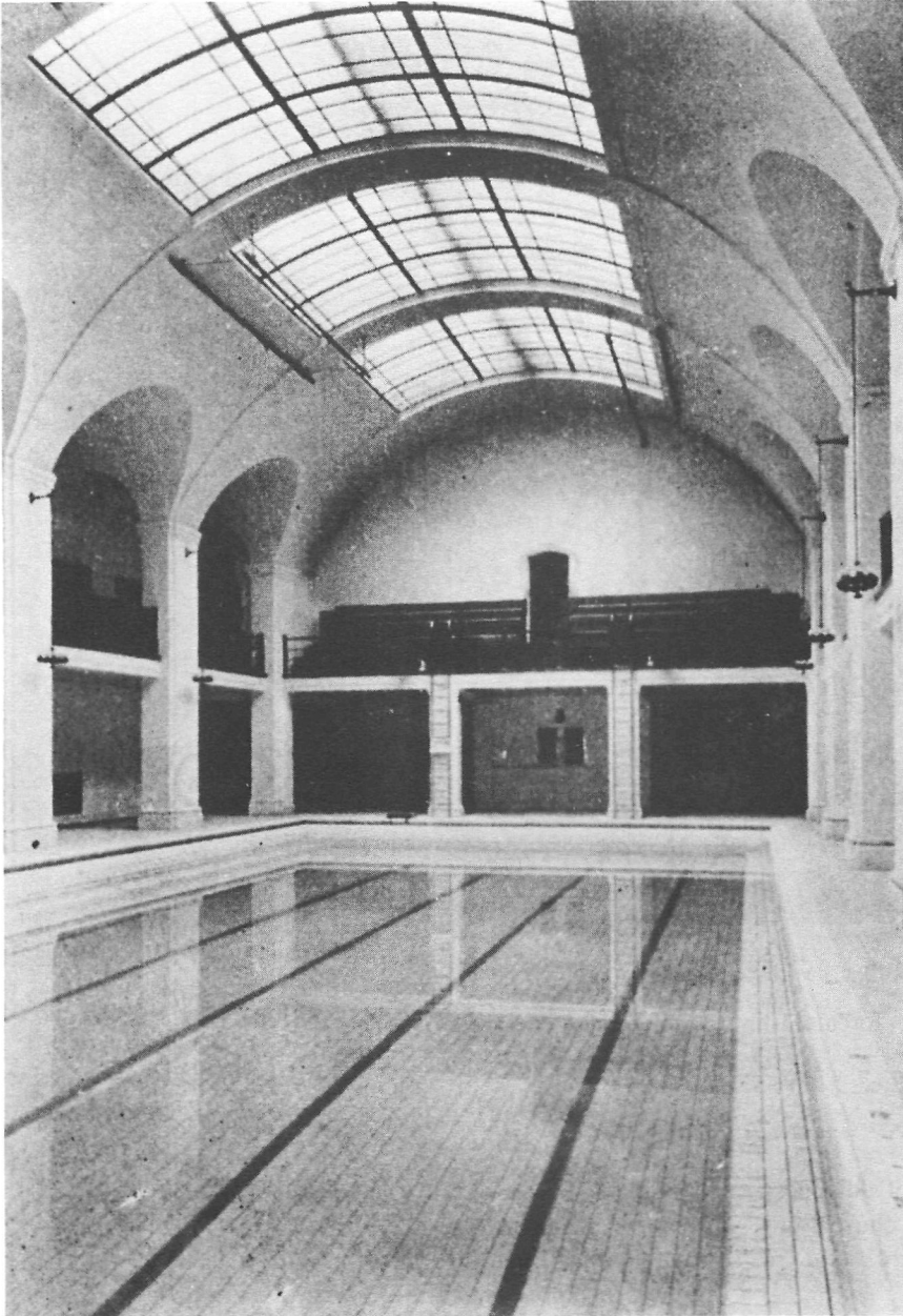
FIGURE 1. Swimming pool in Hart House, University of Toronto, 1919.