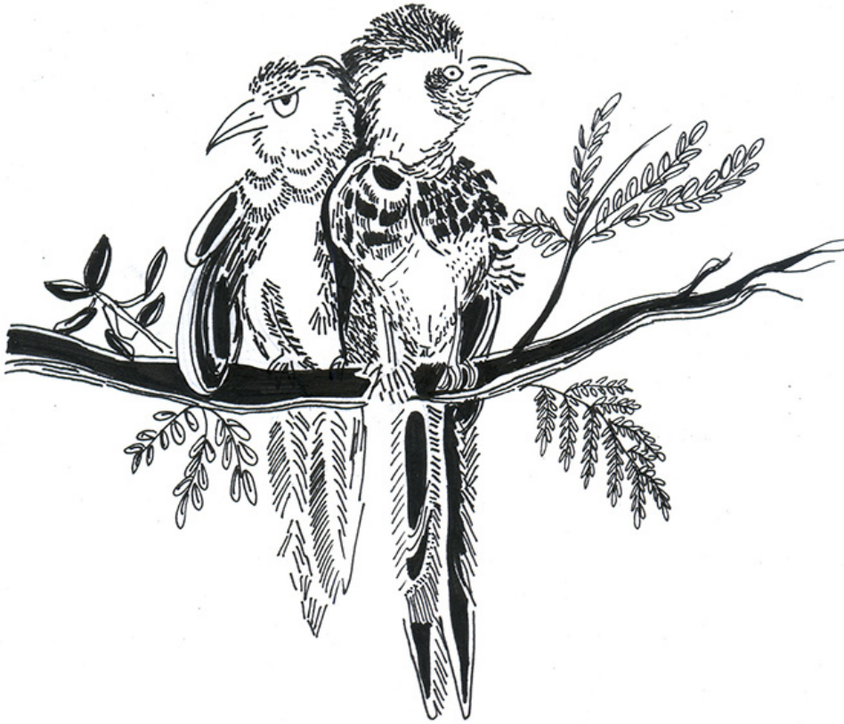
Image: Stylized rendering capturing the quirky attitudes of two babblers, Srivi Kalyan, Two Babblers , 2014, pen and ink.

extends the tripartite reality into a creative space where transformations into oneness can happen (Subash Kak, personal email communication, January 31, 2017). The part and the whole, the microcosm and macrocosm, the finite and the infinite, the one and the many are entwined, interwoven, diffused, in a flow of exchange, paradoxically both existent and non-existent. Great emotion suffuses the being, devoid of all character of joy or sorrow, and yet it rises at the confluence of both. The transcendent emotion and aesthetic emotion coalesce into deep experiencing of multiple levels of interconnectedness.