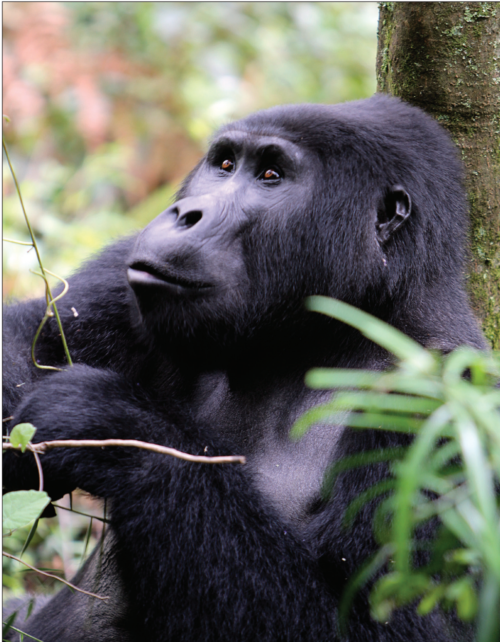
FIGURE 1 : Mountain Gorilla ( Gorilla Berengei Berengei ).