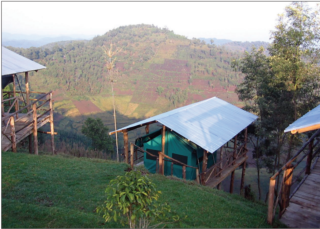
FIGURE 2 : Gorilla Friends Tented Camp, Ruhija (photo : courtesy of M. Campbell).

interviewees used the services of a tour operator or travel agent to arrange their trip to Uganda and gorilla tracking, 15 were travelling independently.