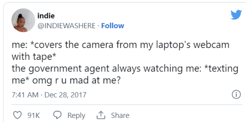
Figure 21: An emotional connection between FBI agent and the individual.