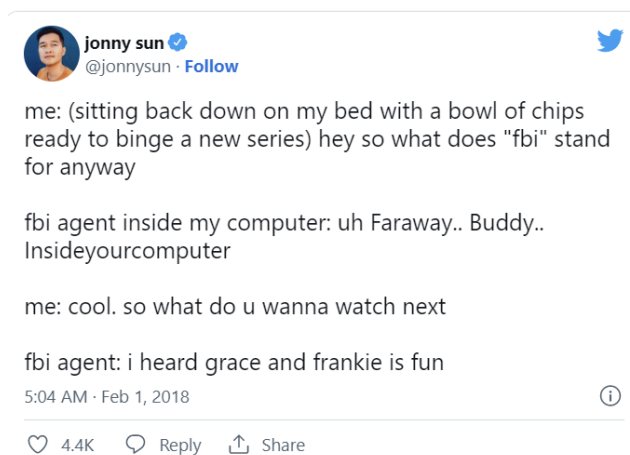
Figure 1: Surveillance as companionship (Bryan 2018)

The FBI agent meme parodies the unification of “divine omniscience and secular surveillance” by presenting a softer image of surveillance, humorously suggesting that the constant gaze of the State is attentive and benevolent. Following Marxist theory, Harding (201: 43–44) contends that a positive perception of surveillance stems from alienated consciousness, as surveillance provides “an illusory balm for genuine human suffering.” Individuals turn to surveillance out of hope or need for security and stability, but find neither. In this light, surveillant companionship arises from a sense of alienation, striking an uneasy balance between intrusion and the longing for care and intimacy, the desire to be truly seen.