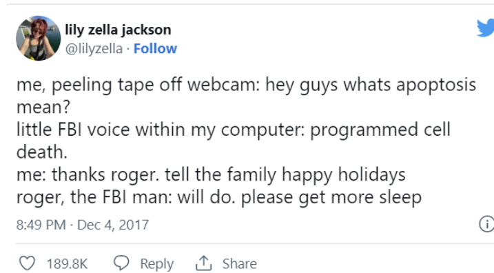
Figure 5: The FBI agent helping the individual with homework (Flaherty 2018).

Another popular variant of the meme touches on privacy, a sense of resignation, and the extreme intimacy of surveillant companionship. In Figure 5, the individual, who has covered their computer camera with tape in a seemingly futile attempt at privacy, removes it in order to ask the camera for help with their homework. The FBI agent immediately gives the answer, seeming to replace traditional search engines as a source of information and knowledge. The individual again thanks them by name and passes along greetings to the agent's family. The agent replies by gently suggesting that the individual try to get more sleep, implying full awareness of their behavior with or without the tape covering the camera.