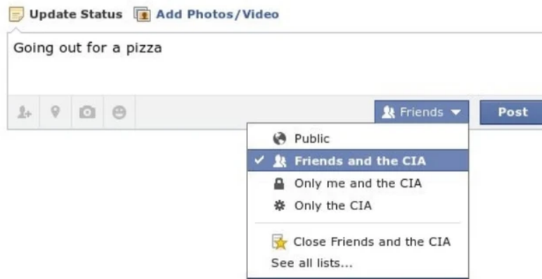
Figure 19: Surveillance and social media sharing.