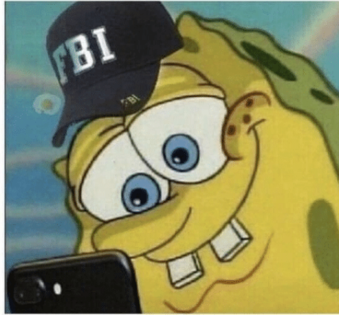
Figure 3: FBI agent as Spongebob Squarepants.

My FBI guy watching me drink water for the first time in weeks