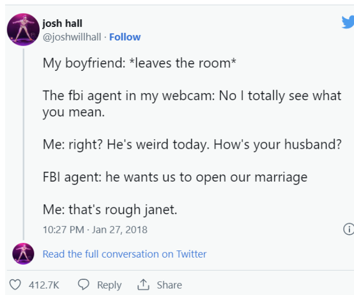
Figure 4: Meme depicting a conversation between the individual and FBI agent (Strunck 2018).

More than just care, however, the FBI agent meme often depicts a very intimate personal relationship between the individual and the government agent. The government agent witnesses everything in the individual's life; the meme suggests that the surveillant companion knows the individual better than anyone else. In some cases, the FBI agent is merely a sympathetic witness. In others, the meme depicts a mutual relationship of care and intimacy. One widely circulated version (Figure 4) originated on Twitter in January 2018, where it was liked more than 412,000 times and subsequently spread to various other platforms. This version depicts the FBI agent commiserating about romantic problems and validating the individual's sense of unease with their partner. The meme also suggests a degree of closeness or intimacy with the FBI agent that even the individual's partner may not share. The individual then returns the gesture of care, calling the FBI agent by name, asking after the agent's marriage, and offering sympathy.