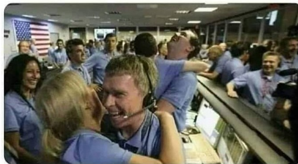
Figure 18: The FBI shown celebrating the individual's personal life.