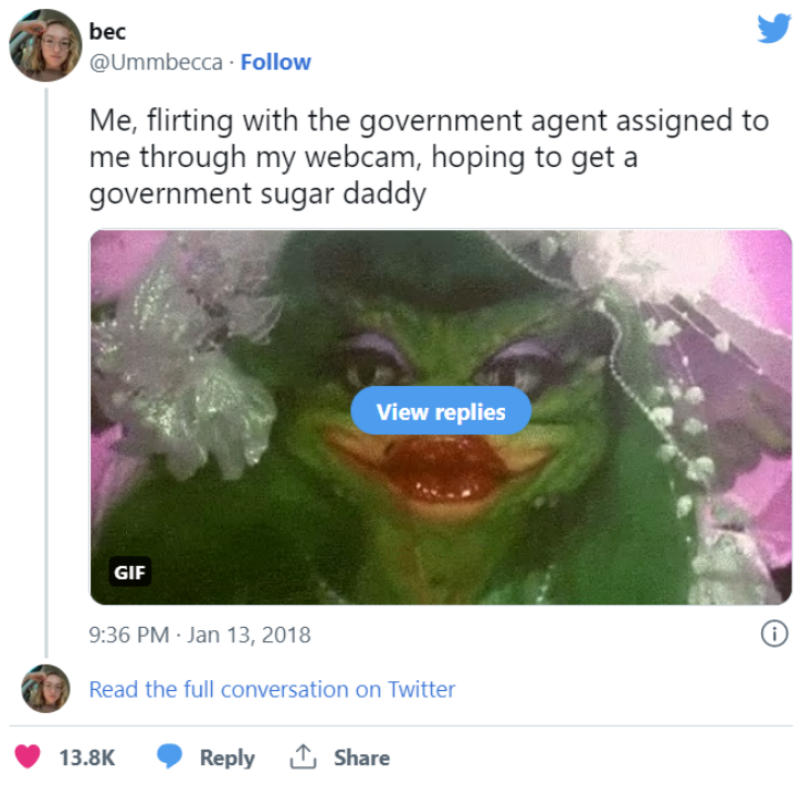
Figure 16: Flirting with the surveillant gaze.