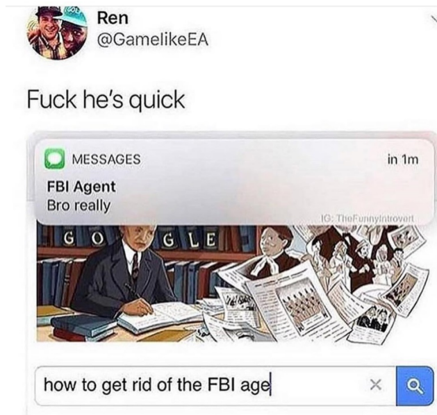
Figure 11: How to Get Rid of the FBI Agent (23 Hilarious FBI Agent Memes You Can't Risk to Pass Up 2019)

Another version (Figure 10) parodied a Reddit thread by writing “People who use the Dark Web, what’s the most unsettling thing you’ve seen or experienced on there?” The text is accompanied by an image of someone peeking out of a dumpster with the text “Nice try FBI.” This version not only calls attention to the fact that anything posted online can be observed by others but also implies a strategy of entrapment on the part of surveillance agencies, where seemingly innocuous questions could trigger severe consequences. The meme suggests that even an anonymous platform like Reddit does not protect users’ data and identities from being tracked, traced, and known. Although the meme critiques the attempted government surveillance or entrapment, it still relies on an individual, rather than collective, response to surveillance. Individuals must be knowledgeable enough to recognize the trap for what it is; their personal tech savviness determines whether they will take the bait or not. This view suggests that individuals possess a level of control over their personal data and information, as well as the choice to engage or not, a view at odds with larger systems of surveillance and data collection.