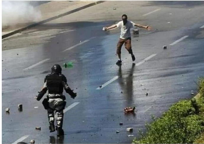
Figure 17: Meeting the FBI agent during a protest.