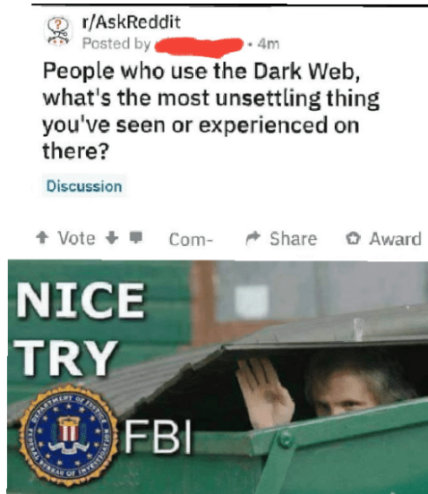
Figure 10: Exposing the surveillant gaze.

Another version (Figure 10) parodied a Reddit thread by writing “People who use the Dark Web, what’s the most unsettling thing you’ve seen or experienced on there?” The text is accompanied by an image of someone peeking out of a dumpster with the text “Nice try FBI.” This version not only calls attention to the fact that anything posted online can be observed by others but also implies a strategy of entrapment on the part of surveillance agencies, where seemingly innocuous questions could trigger severe consequences. The meme suggests that even an anonymous platform like Reddit does not protect users’ data and identities from being tracked, traced, and known. Although the meme critiques the attempted government surveillance or entrapment, it still relies on an individual, rather than collective, response to surveillance. Individuals must be knowledgeable enough to recognize the trap for what it is; their personal tech savviness determines whether they will take the bait or not. This view suggests that individuals possess a level of control over their personal data and information, as well as the choice to engage or not, a view at odds with larger systems of surveillance and data collection.