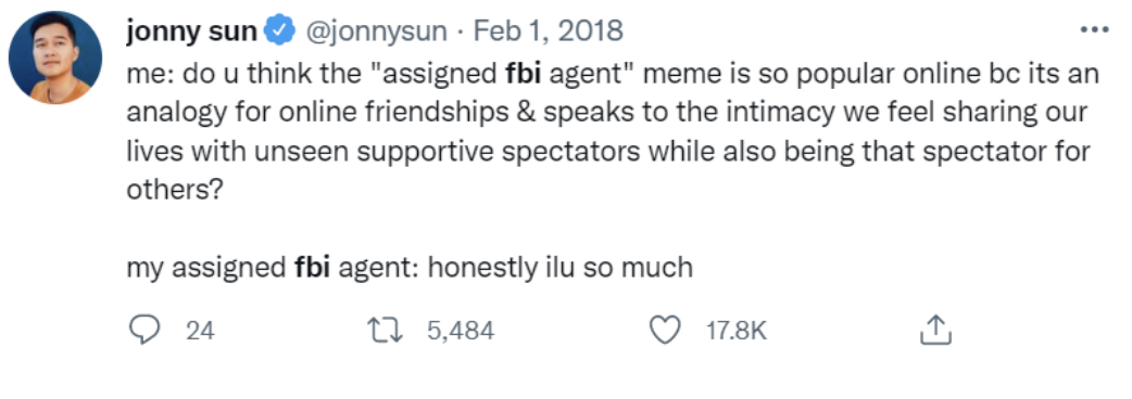
Figure 12: FBI agent meme as a form of social sharing.

However, many versions of the meme challenged or ridiculed the figure of the FBI agent and rejected the normalization of mass surveillance. Memes can serve as vehicles for public critique, forms of political participation, or tactics of dissent. Their inherently collective nature and wide circulation can rupture the isolationist tendencies of digital resignation and surveillance realism. In this communal critique of mass surveillance, the memes offer a counterweight to surveillance realism by questioning whether such surveillance is either acceptable or inevitable. Critical variations of the FBI agent meme, such as the version with Woodson, juxtapose surveillant intrusions with images of protest, suggesting that collective social action could be another response to mass surveillance, rather than isolated individual efforts. Although the meme depicts the surveillant apparatus as a form of ambivalent companionship, as suggested by Figure 12, the collective and collaborative nature of memes and the participation in communal humor and critique offers a different kind of companionship, one organized around a recognition of shared grievances and surveillant intrusions.