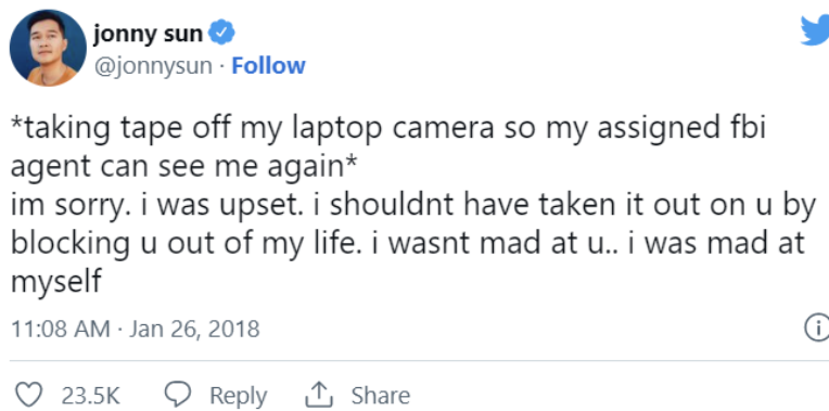
Figure 20: Satirizing the emotional connection between surveillance and the individual.