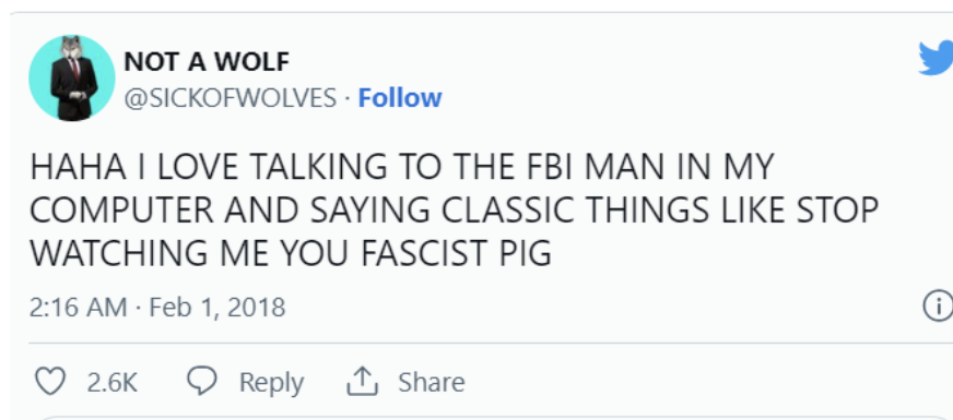
Figure 9: Critiquing or resisting the surveillant gaze (Jackson 2018).

At the same time, Shifman (2014: 120) argues that creating and sharing memes is a form of political participation, by engaging in “a normative debate about how the world should look and the best way to get there.” Memes as a form of subversive folk practice or as an intervention in media discourses challenge the normalization of surveillance. If digital resignation reflects isolated, individual efforts at privacy protection, the widely shared FBI agent meme suggests a public reckoning with surveillance, affording a link between the personal and the political in generating collective action. Creating, circulating, and satirizing the figure of the FBI agent is a way of critiquing the fact that government surveillance has insinuated itself into every facet of daily life.