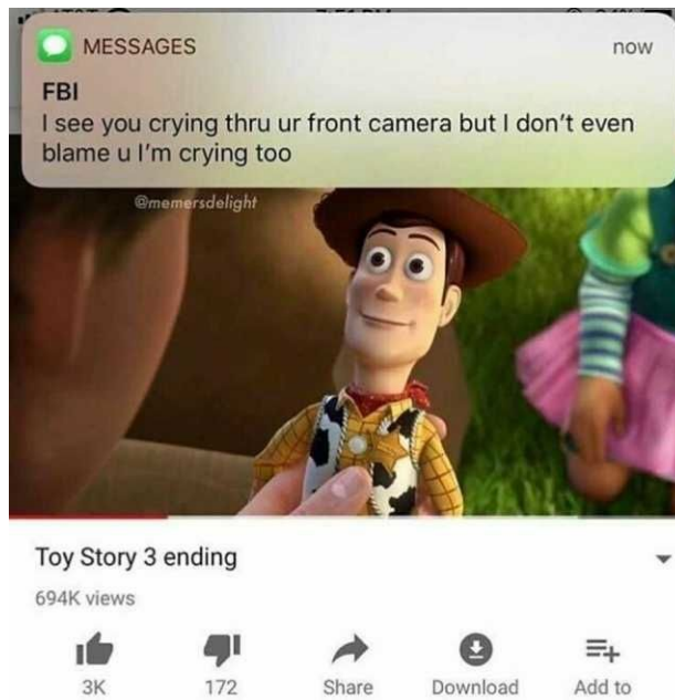
Figure 14: FBI agent meme with Toy Story reference.