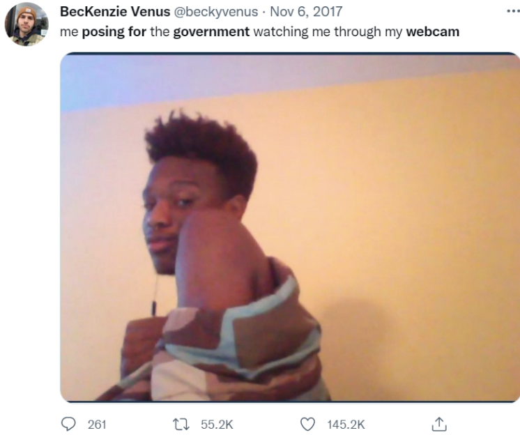
Figure 15: The FBI agent meme and the sexualized gaze.