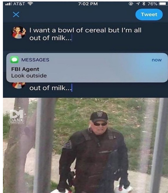
Figure 2: FBI agent delivering milk.

In Figure 1, the individual is relaxing in their bedroom (ordinarily a private or intimate space), but all the while, they are conversing with the FBI agent/surveillant apparatus through their computer, implying that the relationship is ongoing and familiar. When the individual asks what “FBI” stands for, the agent replies “Faraway... Buddy... Insideyourcomputer,” a response that the individual placidly accepts before asking what they should watch together next. Even in this humorous depiction, the agent’s response attempts to mask the surveillant nature of the relationship by framing it as a type of long-distance friendship. The meme describes a scene reminiscent of a slumber party, snacking on chips and watching a movie, but the only participants are the individual and the unknown (but seemingly familiar) surveillant apparatus.