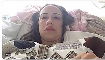
Figure 6: Digital resignation (23 Hilarious FBI Agent Memes You Can't Risk to Pass Up 2019).

i honestly don't care if an fbi agent is watching me thru my laptop cam cause all they're gonna see is me like