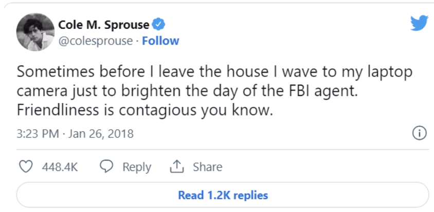
Figure 22: FBI agent meme and awareness of constant surveillance.