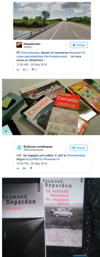
FIGURE 2 : Storify - Transcan16 (by Marie-Christine Corbeil)