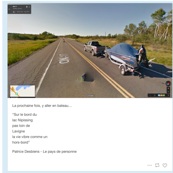
FIGURE 3 : Postcards from Street View - Transcan16 (by Servanne Monjour)

itinerary with the help of Google Maps, tweeting the progression of our trip, reading literary works about the spaces that we crossed, and producing new narratives.