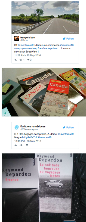
FIGURE 2 : Storify - Transcan16 (by Marie-Christine Corbeil)