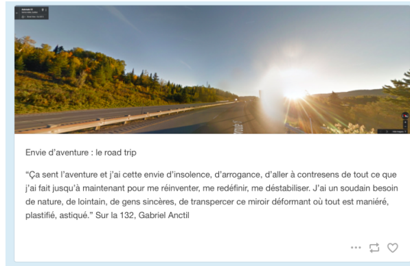
FIGURE 4 : Postcards from Street View - Transcan16 (by Servanne Monjour)

allowing our hashtag to live on, diverted, disfigured, reinterpreted.