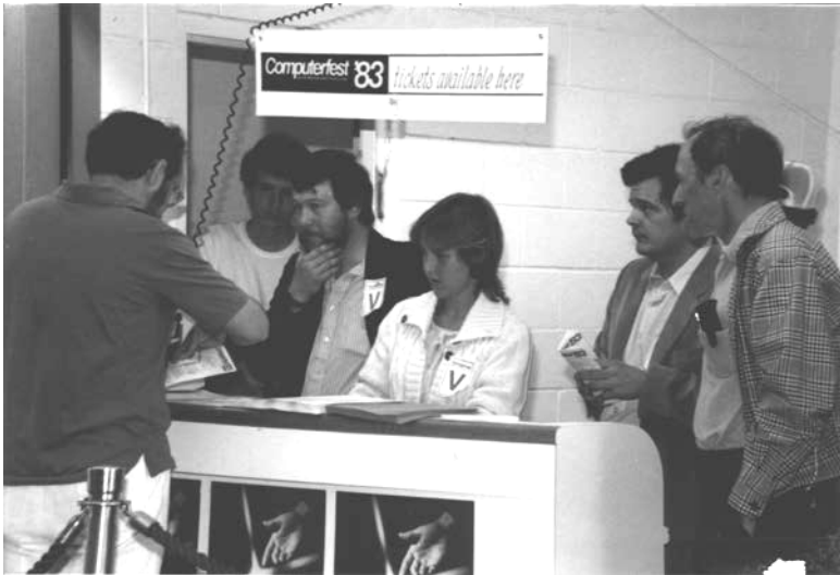
Figure 5. Lining up for tickets at Computerfest'83.