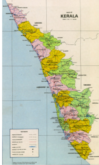
Illustration 2 : Map of Kerala

A few notes regarding caste ( jati ) in historical Kerala may help to contextualize the argument that follows. The Nayar (also spelled “Nair”) caste of Kerala is of chief concern to understanding how Mohiniyattam developed via modes not contained solely within Iconic replication and transmission since, during the 19th century (and perhaps prior), the women who practiced Mohiniyattam were “invariably from Nayar communities” (Jones 1973; Jones 2013; see also Lemos interviews 2003, 2004, 2007, 2008, 2013). 2 Significantly, these 19th century Mohiniyattam dancers were from Nayar communities that practiced a form of polyandry in which one woman could be “married” to several men. A lack of Iconicity between historical 19th century Mohiniyattam dance and its contemporary counterpart is evident with the change in social relations surrounding the dance. 3