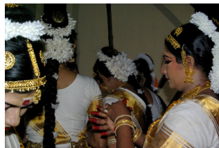
Illustration 1 : Photograph by Justine Lemos 2008

Vallathol paid considerable attention to provide new expression and prestige to Mohiniyattam and for sharpening its artistic value. As a result, Mohiniyattam, the visually beautiful art form salvaged itself from obscenities and immoralities and emerged like untainted gold (Amma 1992; Translation from Malayalam V. Kaladharan 2007). (Illustration 1 : Contemporary Mohiniyattam Dancers : “untainted gold”)