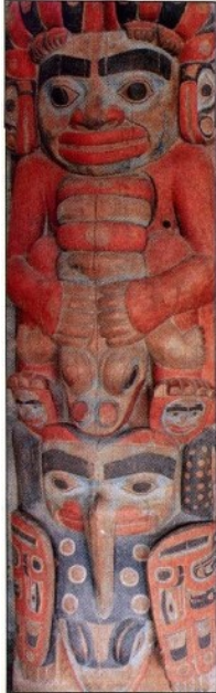
Figure 3. The Wormwood Post—one of four posts from the Whale House.

To complicate the matter further, I would like to explore a third manifestation of a totem pole: the totems found within the Whale House in a small Tlingit village in southeastern Alaska. I draw on these totems to add an international and comparative layer to the Canada totem and the Wonderbird totem. The following case reflects the aspirations of Article 31 of UNDRIP , which calls for Indigenous control and protection of cultural expressions.