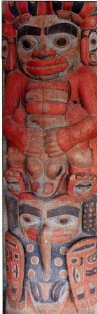
Figure 3. The Wormwood Post—one of four posts from the Whale House.

To complicate the matter further, I would like to explore a third manifestation of a totem pole: the totems found within the Whale House in a small Tlingit village in southeastern Alaska. I draw on these totems to add an international and comparative layer to the Canada totem and the Wonderbird totem. The following case reflects the aspirations of Article 31 of UNDRIP , which calls for Indigenous control and protection of cultural expressions.