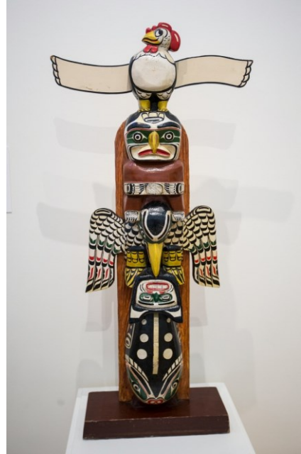
Left: Figure 1. Ambiguously labelled totem poles for sale at BC Ferries Gift shop. Right: Figure 2. Wonderbird Totem Pole , Ellen Neel, 1953.

White Spot restaurants commissioned Ellen Neel, the first Kwakwaka'wakw woman to carve professionally, to carve The Wonderbird Pole in 1953. 1 The pole was also featured on the company's menus along with The Wonderbird Legend , authored by Ellen Neel. The Wonderbird Legend was printed on the cover of White Spot menus in the fifties and read as follows: