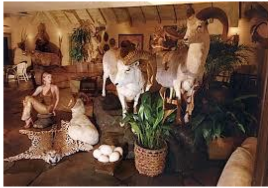
Figure 3. Daniela Rossell Untitled ( Ricas y Famosas ), 1999 C-print 50"x 60"