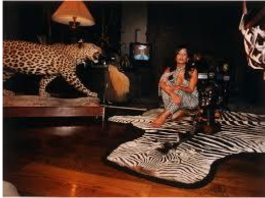
Figure 1. Daniela Rossell Untitled ( Ricas y Famosas ), 1999 C-print 50"x 60"