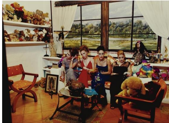
Figure 2. Daniela Rossell Untitled ( Ricas y Famosas ), 1999 C-print 50"x 60"