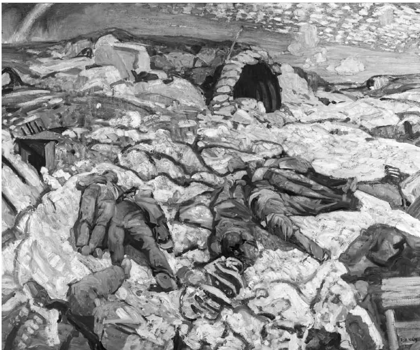
Figure 1. Frederick Varley, The Sunken Road , 1919, oil on canvas, 132.7 x 162.7 cm, Canadian War Museum, Beaverbrook Collection of War Art, I9710261-0771.