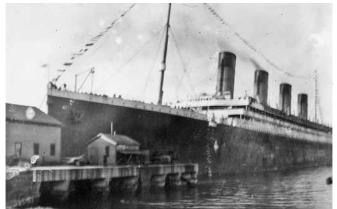
Figure 8. Arthur Lismer, The R.M.S. Olympic Moored in Halifax Harbour , c. 1918–19, photograph, 12 x 17.5 cm, Canadian War Museum, George Metcalf Archival Collection, Arthur Lismer fonds, 19790051-021.