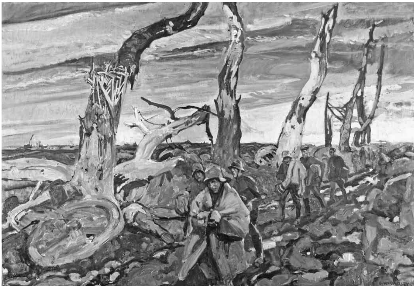
Figure 3. Frederick Varley, German Prisoners , c. 1919, oil on canvas, 127.4 × 183.7 cm, Canadian War Museum, Beaverbrook Collection of War Art, 19710261-0807.