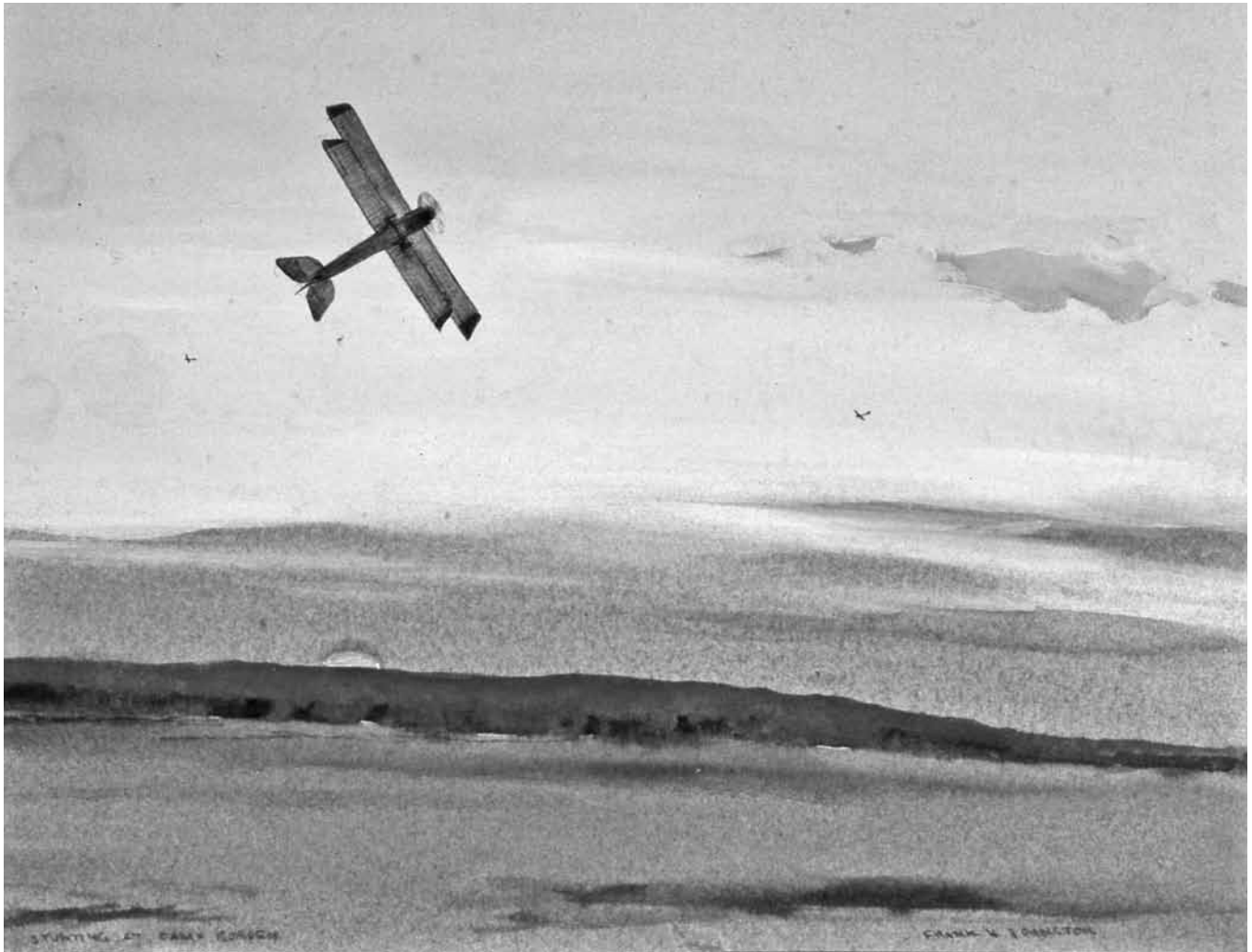
Figure 9. Frank Johnston, Stunting at Camp Borden , undated, watercolour and gouache on art board, 28.4 x 35.8 cm, Canadian War Museum, Beaverbrook Collection of War Art, 19710261-0311.