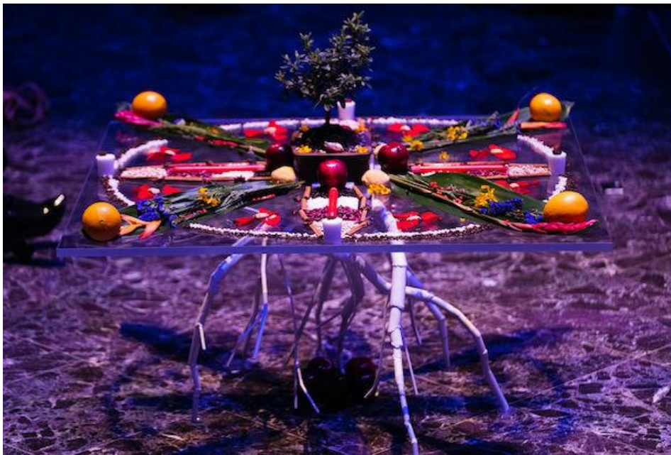
Altar in Zaccho Dance Theatre’s Love, A State of Grace. Grace Cathedral, San Francisco, CA, 2022.