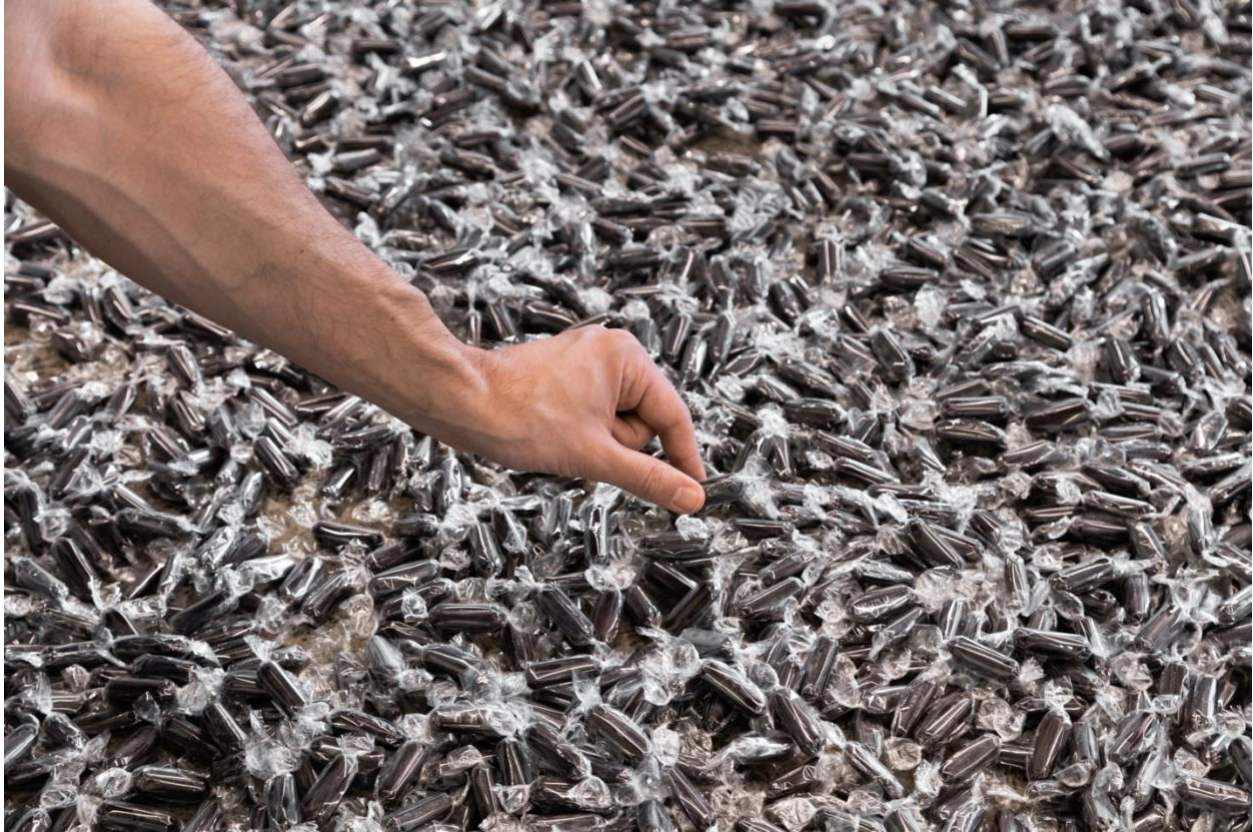
Felix Gonzalez-Torres, "Untitled" (Public Opinion) , 1991, detail view, MOCA Toronto. Copyright Felix Gonzalez-Torres Foundation. Courtesy of MOCA Toronto. Photo: Laura Findlay.

LMC. I'm so fascinated by the tension that might lie within the works. For example, what might it mean by having "Untitled" (North) and "Untitled" (Public Opinion) in the same sightline or having both Summer and Winter as iterations of the exhibition. When I was visiting here in May, I also noticed a theme or maybe a tension between light and dark in the show. I'm thinking about how "Untitled" (Golden) refracts natural light and has its own metallic glimmer or how "Untitled" (North) harnesses electricity and emits light itself. Even "Untitled" 1989 has a reflective sheen to it. Then, you pair that luminosity with "Untitled" (Public Opinion) and "Untitled" (Shield) . While these pieces have a sparkling quality due to their plastic wrap, they are the two pieces that aren't inherently metallic or luminescent— "Untitled" (Public Opinion) 's onyx-like candy base and "Untitled" (Shield) 's matte finish, where even the beige background appears a bit more dull in contrast with the stark white museum walls. Perhaps, in contrast with the other pieces, these two pieces are a bit darker in hue and maybe even in affective tonality.