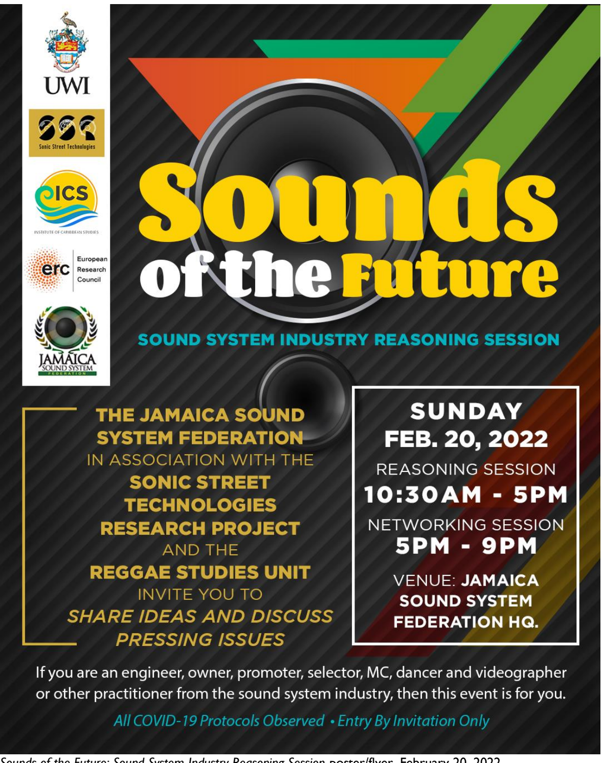
Sounds of the Future: Sound System Industry Reasoning Session poster/flyer, February 20, 2022.

This article frames the day's event as an exercise in practice-based research (PBR), where the practice is that of sound system operations and the research is into the practitioners' ways of knowing. We discuss the theoretical as well as practical and political implications of a PBR methodology having as its subject the popular culture of the Jamaican dancehall sound system scene as an example of the kind of apparatus for playing recorded music—called in our research "sonic street technologies"—to be found across the Global South. PBR cannot tell other than an "inside story" of a particular scene or event, in marked contrast to the typical corporate consultants' report.<sup>3</sup> We argue that this is particularly important with marginalized, that is, subaltern, popular cultures whose knowledge systems are situated and largely embodied and oral.