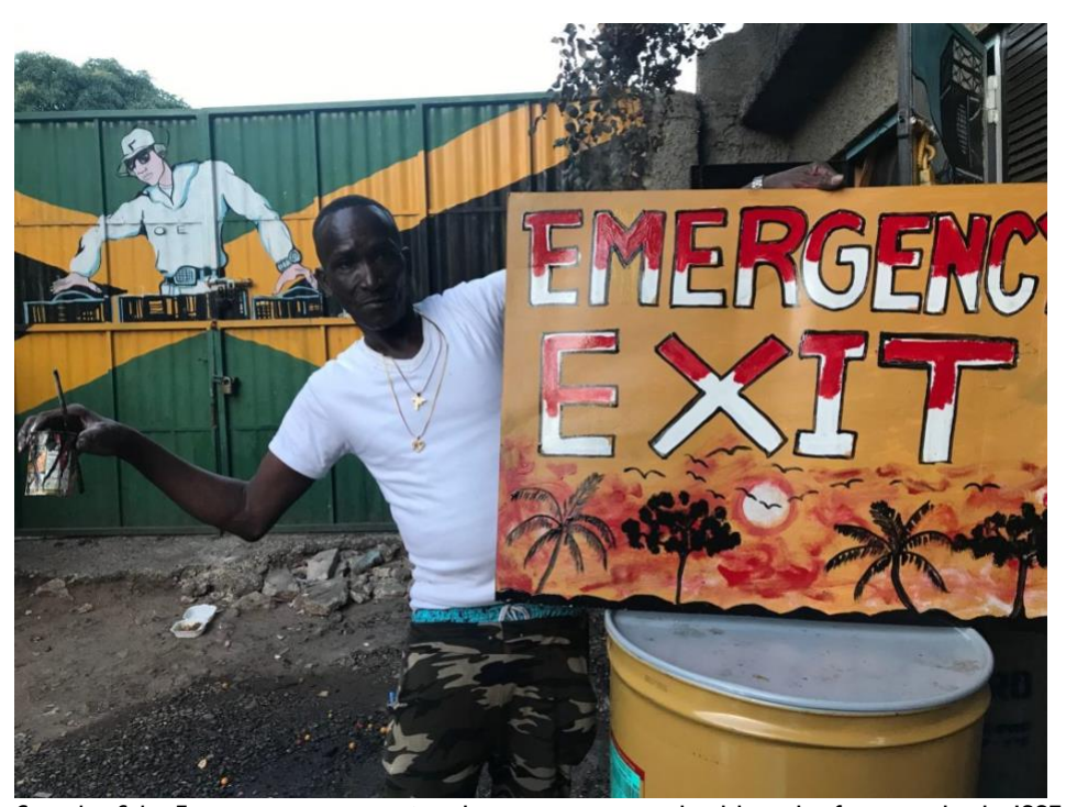
Sounds of the Future event: preparing the venue to meet health and safety standards. JSSF HQ, Kingston, Jamaica, February 20, 2022.

The authorities often blame sound system sessions for causing violence and social unrest rather than seeing them as grassroots strategies to overcome or at least ameliorate existing social challenges (Rivera 2022). The substantial value of sound system culture was certainly one of the points raised in the reasoning discussion. Jamaican sound systems are in fact only an example of one type of street culture and technology. Columbian picós , Mexican sonideros , or Brazilian radiolas and aparelhagens make equally fertile ground for PBR investigations. Such research aims to question knowledge as it is usually understood in academic research; that is, excluding situated, embodied, collective knowledge systems and their subaltern locations.