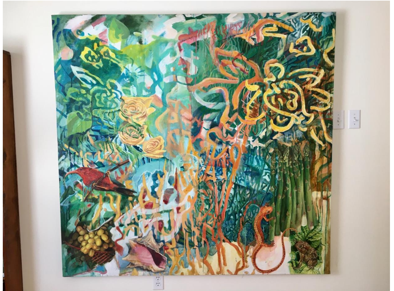
A is for Asparagus (2000), Michael Waterman, acrylic on canvas. Used by permission. Graphic score Ellen used in improvising flute piece Ellen for Tiphaine.

Audio example: Ellen for Tiphaine, improvisation for solo flute, February 24, 2022.