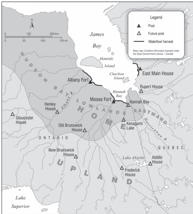
Figure 2: Map of the Moose River watershed

for Eastmain and a few supplies for hunters intending to trade there. 20 Replacing Moose Fort made good business sense, for there was French competition upriver. The company hoped to win back the Rupert River trade, and satisfy Moose River inlanders who complained of the long and difficult route to Albany. 21 The HBC re-established Moose Fort on the same island in the Moose River in 1730, upstream from the original site. It was destroyed by fire during Christmas revelry in 1735 and had to be constructed anew. 22 Trade and relationships in this territory