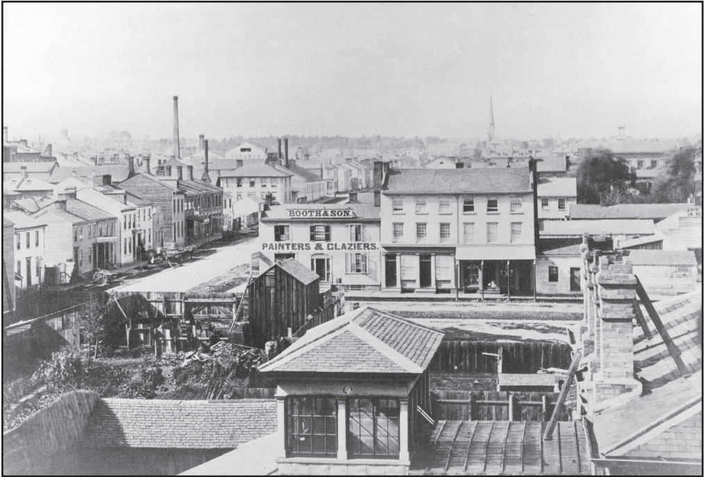
Booth & Son: north-east corner of Adelaide and Victoria streets in 1856. This is the street that the Mansion House Livery Stable was on, next to Booth & Son.