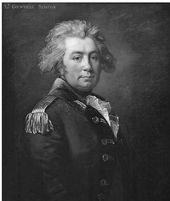
John Graves Simcoe