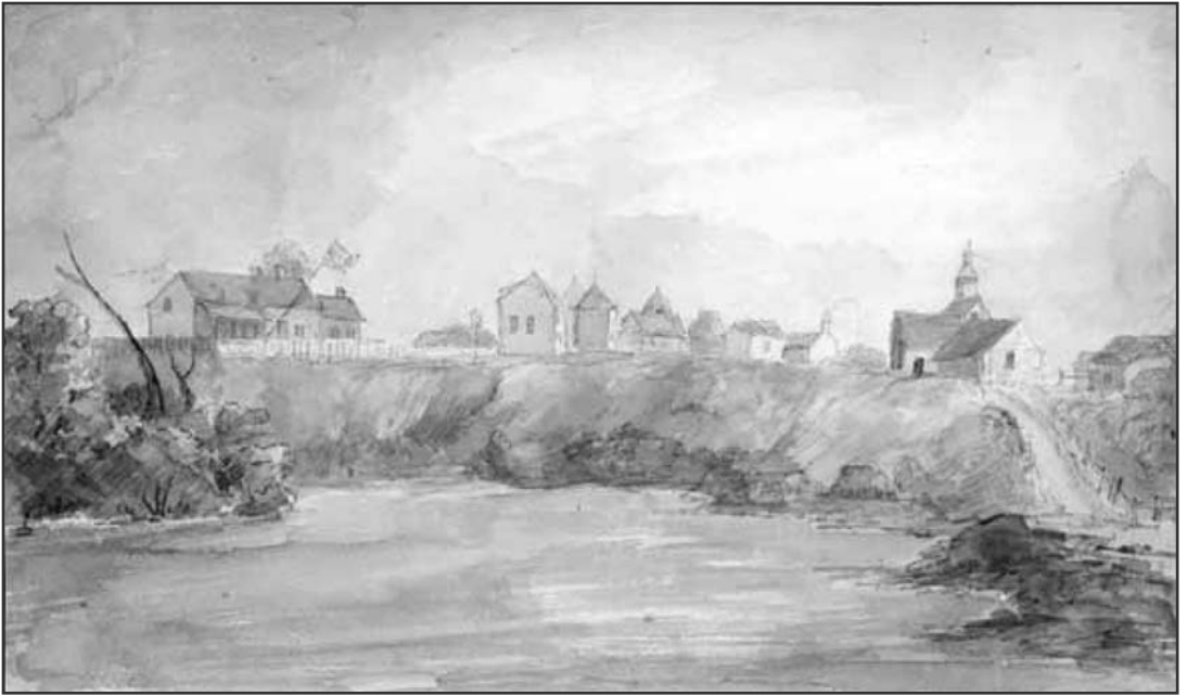
Mohawk Village on the Grand River [ca. 1793]. Watercolour.