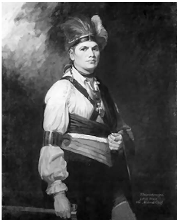
Joseph Brant (Thayendanegea), 1776 by George Romney, National Gallery of Canada, Ottawa. Transfer from the Canadian War Memorials, 1921 (no. 8005)