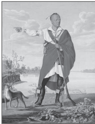
William Berczy, Thayendanegea (Joseph Brant) , c. 1807. National Gallery of Canada, Ottawa (no. 5777)

While travel and hospitality reinforced the dense webs of kinship and friendship between members of dispersed communities, the sources reveal the movements and whereabouts only of locally prominent and well-to-do individuals, precisely those who were most capable and likely of recording these sorts of activities. Without a doubt, hospitality reinforced bonds between elite members of the community, and tracing the perambulations of individuals and where they lodged provides a crude map not just of community but also power relations in early Upper Canada. The extent to which ordinary Mohawks and loyalists reproduced similar patterns of hospitality remains unclear. Certainly Mohawk men went far afield hunting or on diplomatic missions but they do not enter the record often enough to know where they stayed and with whom.