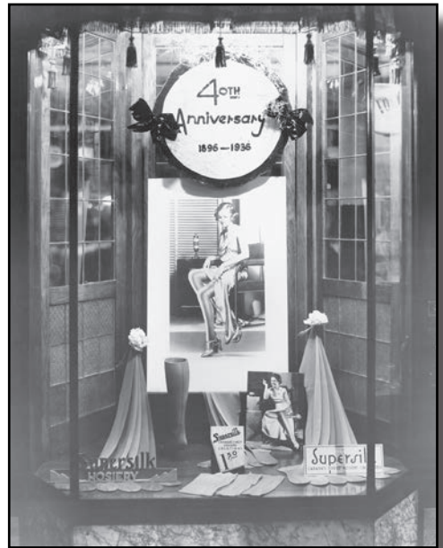
Fortieth anniversary window display, 1936.