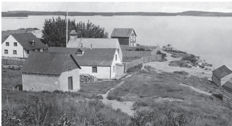
Osnaburgh House.