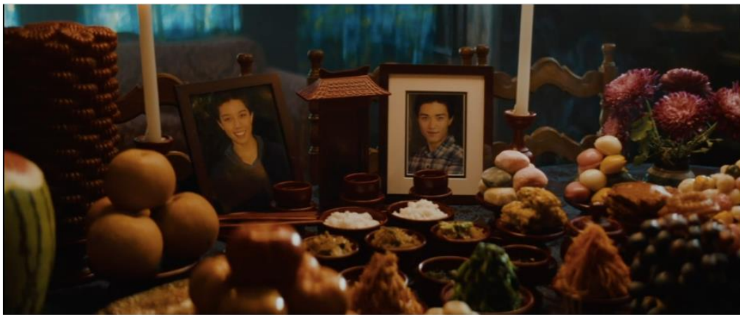
Figure 4: "Edward's photos are on the alter (3:08) in Koreatown Ghost Story ."

dying Ms. Moon, this missing reference to the ancestors uncovers a visual absence, disrupting the kinship lineage, thereby derailing the Moon family in its patrilineal trajectory to maintain the kinship inheritance. The film renders a future built on the ghost marriage, thereby binding the potential with haunting by all ghosts (Edward, as well as the unexplained ghost dressed in Hanbok appearing in the kitchen) in Ms. Moon's house. The haunting in the future thus releases an anxiety associated with this upcoming alternative space-time, which reveals the subject as an improper temporal being, challenging a "proper" temporal relation to the linear past-present-future framework.