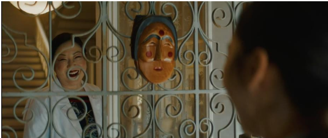
Figure 2: “Ms. Moon answers her door (00:49) in Koreatown Ghost Story .”