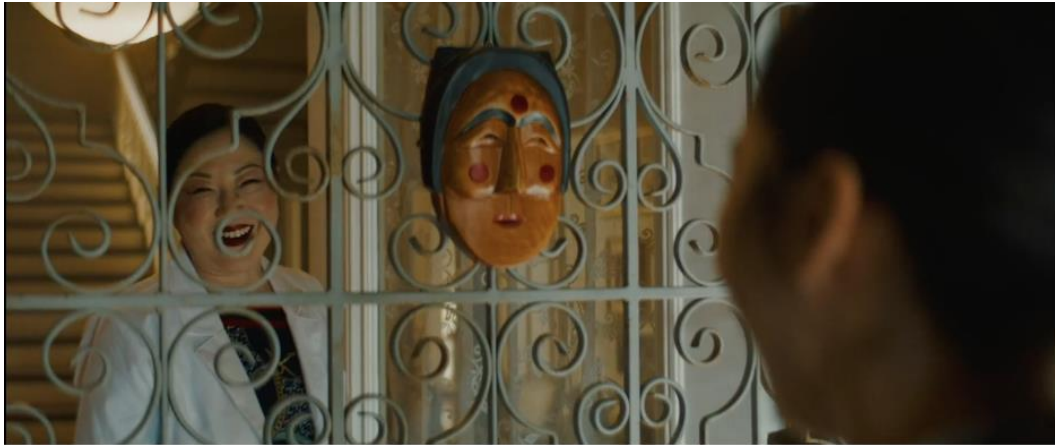
Figure 2: “Ms. Moon answers her door (00:49) in Koreatown Ghost Story .”