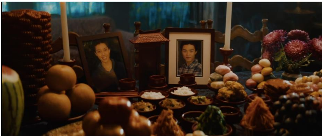
Figure 4: "Edward's photos are on the alter (3:08) in Koreatown Ghost Story ."

dying Ms. Moon, this missing reference to the ancestors uncovers a visual absence, disrupting the kinship lineage, thereby derailing the Moon family in its patrilineal trajectory to maintain the kinship inheritance. The film renders a future built on the ghost marriage, thereby binding the potential with haunting by all ghosts (Edward, as well as the unexplained ghost dressed in Hanbok appearing in the kitchen) in Ms. Moon's house. The haunting in the future thus releases an anxiety associated with this upcoming alternative space-time, which reveals the subject as an improper temporal being, challenging a "proper" temporal relation to the linear past-present-future framework.