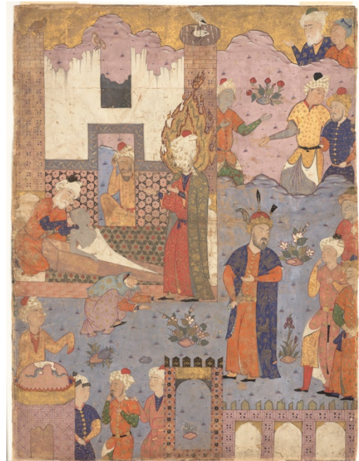
Figure 3 "Muhammad Revives the Sick Boy" featuring the Shi'a Safavid flame-halo, Folio from a Fāhnama (Book of Divination) of Ja'far al-Sadiq (d. 765), ca. 1550, New York, Metropolitan Museum of Art.

in Persia was, on the one hand, a defensive move to free the Safavid reign from Sunni-Ottoman hegemony. On the other hand, the intensity of this religious discrepancy brought the Persians closer to their European allies, as both shared the same enemy, who threatened them territorially and religiously.