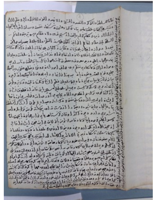
Figure 5 Archivio di Stato di Venezia, Fasc. Persia, Doc. 8, no. 25 (ex. XII.8.25) Persian copy.

with the said weapons suggests that the Republic either permitted or facilitated the Persians' acquisition of necessary military equipment for their conflicts against the Ottomans, which included forthcoming battles from 1603 to 1612. In essence, the Venetians indirectly supported the Persian forces in their anti-Ottoman engagements.