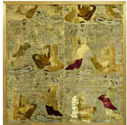
Figure 2 Silk Velvet with the figures of the Virgin Mary and Christ Child, Isfahan, late sixteenth and early seventeenth century, Venice, Museo di Palazzo Mocenigo, CI. XXII, II.37.

the receipt of the Shah's gifts to the Republic in 1603, this silk was recorded as a brocade with fourteen figures embroidered on it. However, since fourteen is an even number, and in each scene, three figures are represented, the number must reflect the unit of the three figures that was originally repeated fourteen times on the seven- braccia silk velvet (Berchet, 1865, 46; Gallo 1967, 261). 13