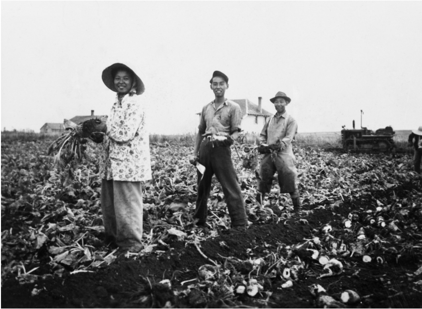
Japanese working in sugar-beet field, southern Alberta (1946 or 1947)