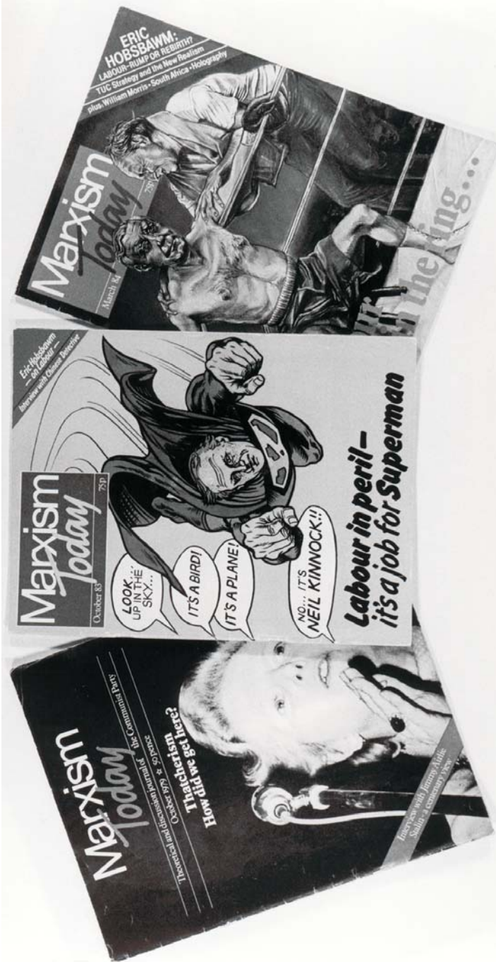
The new second format of Marxism Today was more in keeping with the format of contemporary news-magazines, starting with the October 1979 issue (left). In the aftermath of Labour's disastrous general election showing in June 1983, Eric Hobsbawm's feature articles, "Labour's Lost Millions" and "Labour: Rump or Rebirth?" published respectively in the October 1983 (centre) and March 1984 (right) issues, were critical interventions which provoked intense debate over the Labour Party's future.