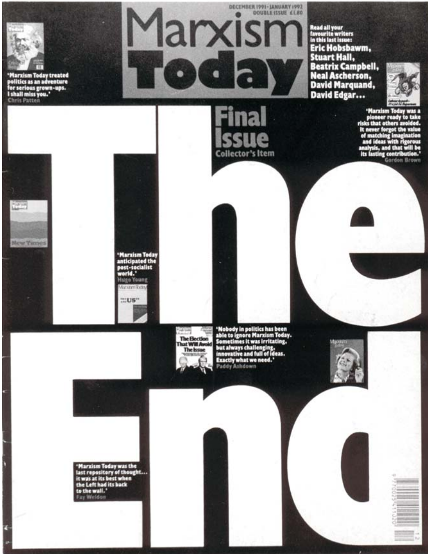
This ostensible last issue of Marxism Today in December 1991 was a celebration of the contributions and impact made by Eric Hobsbawm, among others, to the debates on the Left during the late 1970s and 1980s. A one-off issue of Marxism Today was published in October 1998, with Hobsbawm, Stuart Hall, and other former contributors critiquing Tony Blair's New Labour government, despite Hall referring to Blair as the " Marxism Today candidate" in 1994.