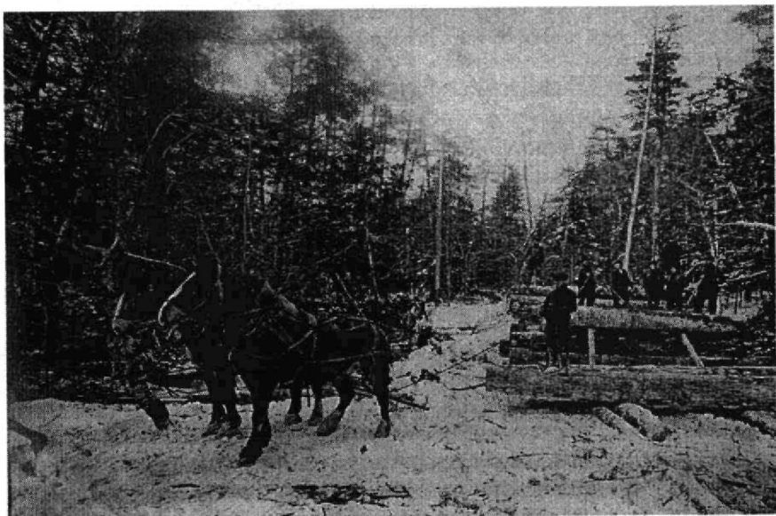
In the Bush