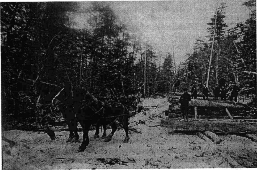
In the Bush