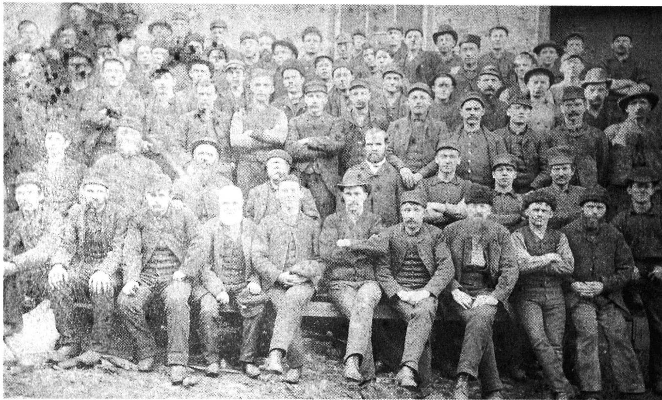
The workers of Cowan & Co. produced engines, boilers, and a variety of machinery.