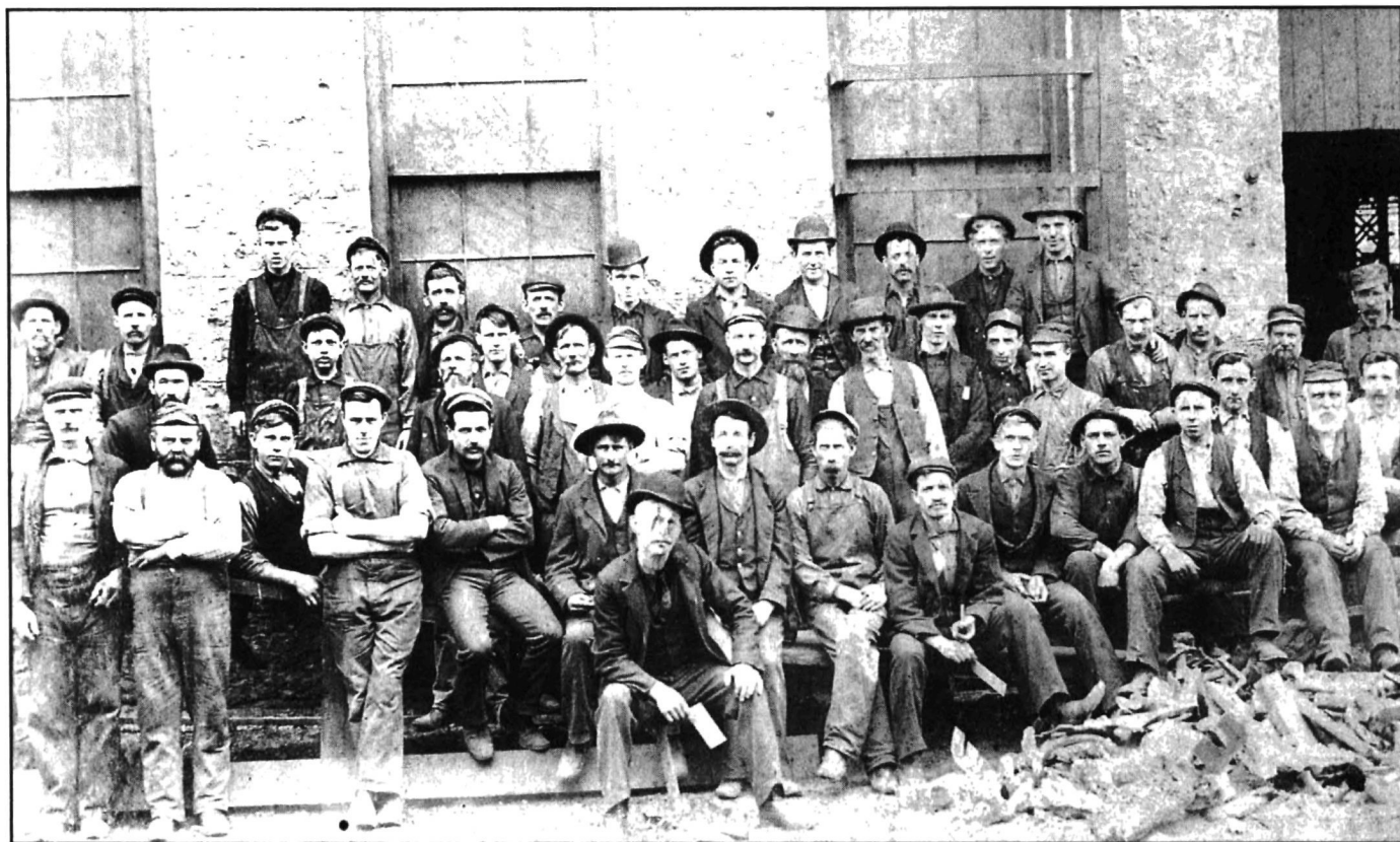
A group of workers outside the Goldie & McCulloch Foundry circa 1890.