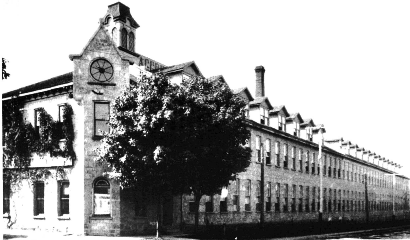
The MacGregor, Gourlay & Co. factory of Concession Street in Galt, circa 1895, produced iron and woodworking machine tools.