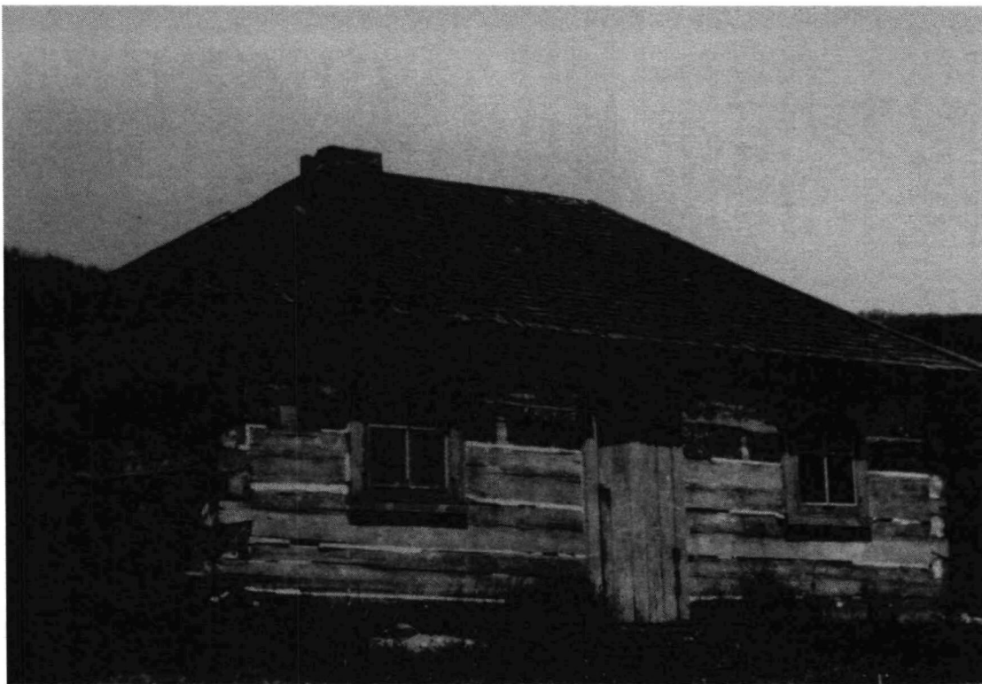
Fig. 4. Fort Wellington guard house where soldiers were held prisoner for drunkenness, fighting, and other misdemeanors. The building has been demolished.