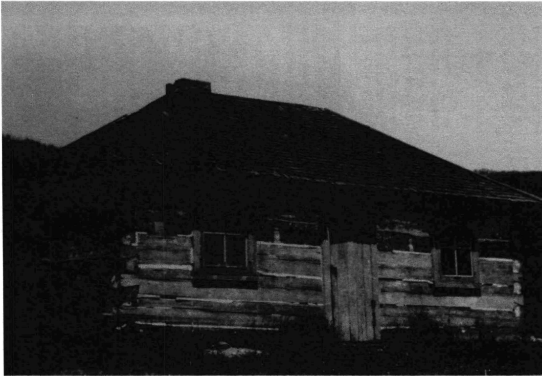
Fig. 4. Fort Wellington guard house where soldiers were held prisoner for drunkenness, fighting, and other misdemeanors. The building has been demolished.