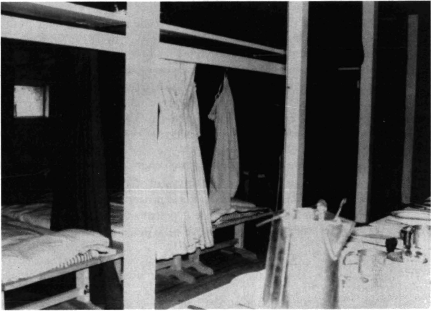
Fig. 2. Reconstruction of crowded living quarters at Fort Wellington (c. 1846).

took place in 1812. The garrison gradually declined to the point that it was "put up for sale" because it was "practically useless" and "had virtually to be rebuilt" to meet the need for frontier defences inspired by the 1837 Rebellion. 11 The rebuilding was undertaken by the Royal Engineers of Kingston in 1838. The Fort saw military action five times: in 1812, 1838, 1860, 1865, and 1866. Usually less than 100 men occupied the garrison and approximately 30 women and 40 children were also present, but numbers often expanded in times of crisis. 12