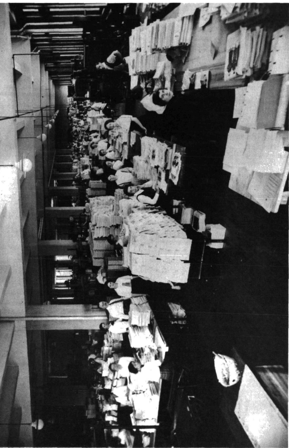
Methodist Publishing House, "Busy Bindery,"