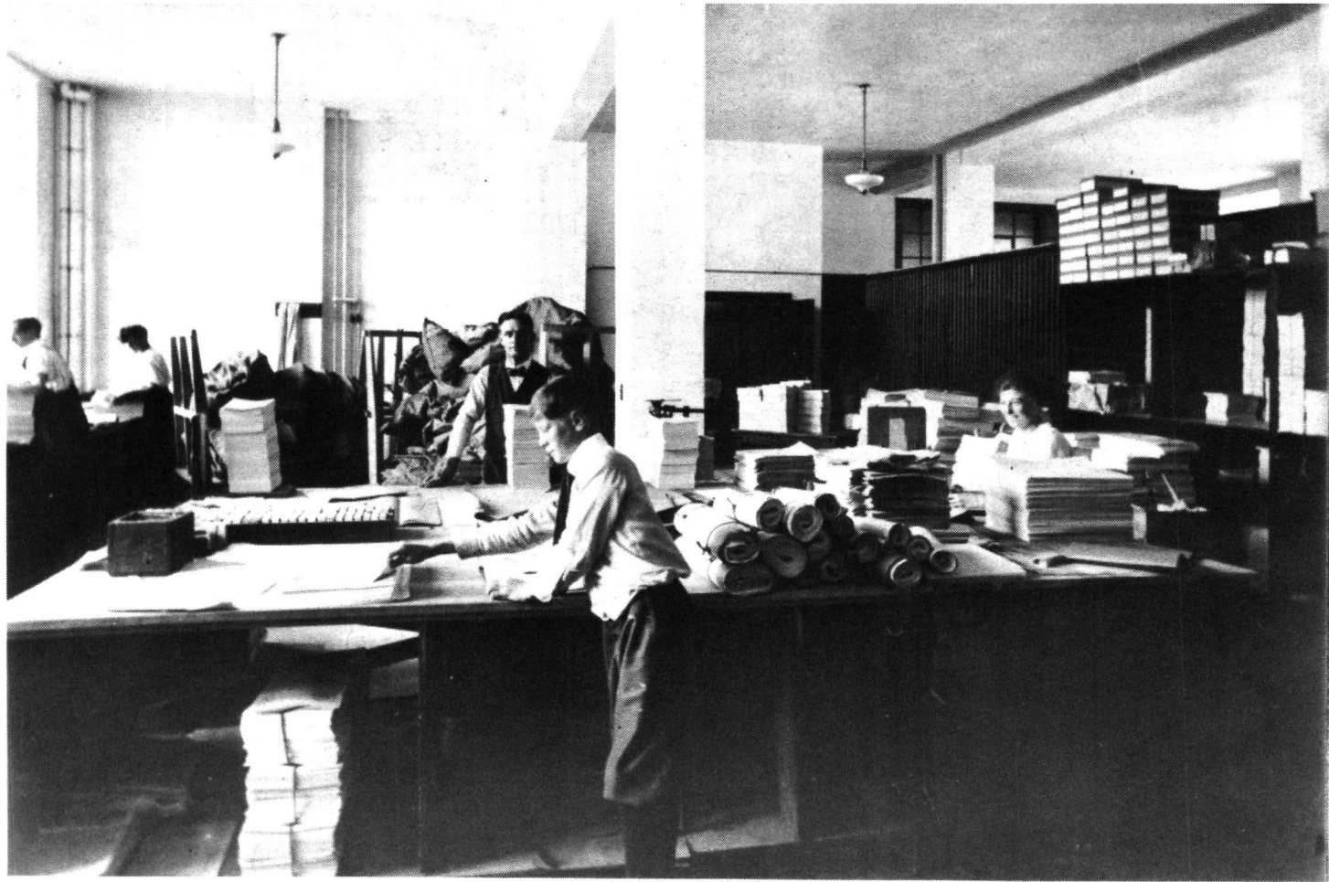
Methodist Publishing House, Corner of the Mailing Room, Archives of The United Church of Canada, Toronto.