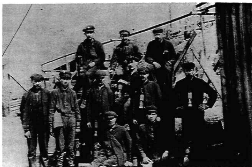
A group of miners using Davy safety lamps in 1910.