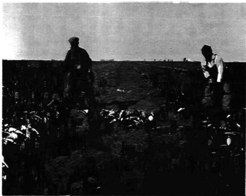
Harvesting sugar beets, 1930's.