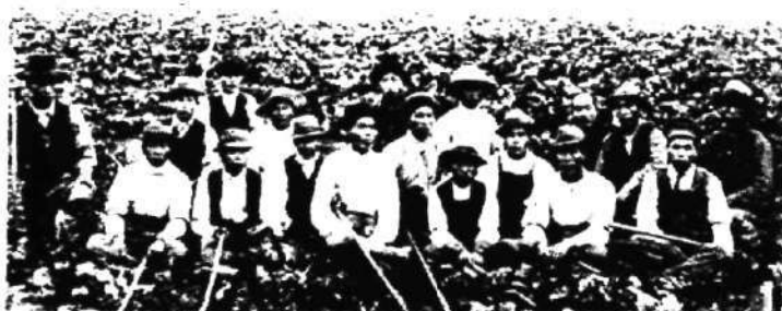
Japanese Contract Labourers of the Knight Sugar Co., 1904.

Thus the Knight Sugar Company was never able to obtain enough beets to operate at an efficient level, even with an attractive price of $5 a ton. Beet acreage in Alberta reached a maximum of 5,200 in 1908 and then decreased annually. 4 The company tried to provide its own beets by planting as many as 2,000 acres on its own and hiring labour to work them, but it had no more success than the local farmers. Few whites wanted to hoe sugar beets. Japanese and Chinese labour could not be obtained in sufficient quantities without arousing community opposition to the importation of Orientals. Indians were less productive, sometimes damaged plants at the critical thinning stage and could not be counted upon to remain on the job throughout the season. 5 When the twelve year tax exemption ended in 1914, the Knight Sugar Company's Board of Directors voted to cease operations, and the factory was dismantled and moved to the United States. 6