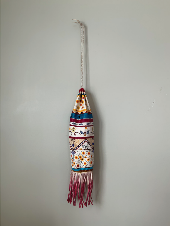
Figure 5: Bag made by Margaret Orr during the project workshops, which she gave to someone as a gift.