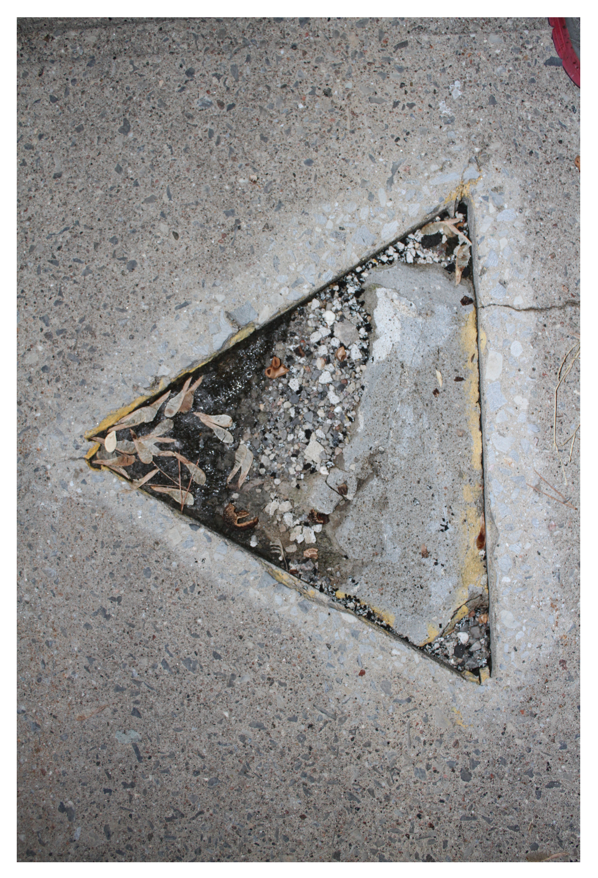
Figure 10: a (syllabics series) (2015), digital photograph. From my syllabics series (https://barrypottle.com/portfolio/syllabics-project-2017-ongoing/). The syllabics series speaks to how our National Inuit Organization, Inuit Tapiriit Kanatami, has developed a standardized Inuit writing system based on Roman orthography, Inuktut Qaliujaaqpait. As I go around my regions, I find images that speak to and look like Inuit syllabics. I am attempting to bring awareness to this subject matter and also trying to push the limits of photography.