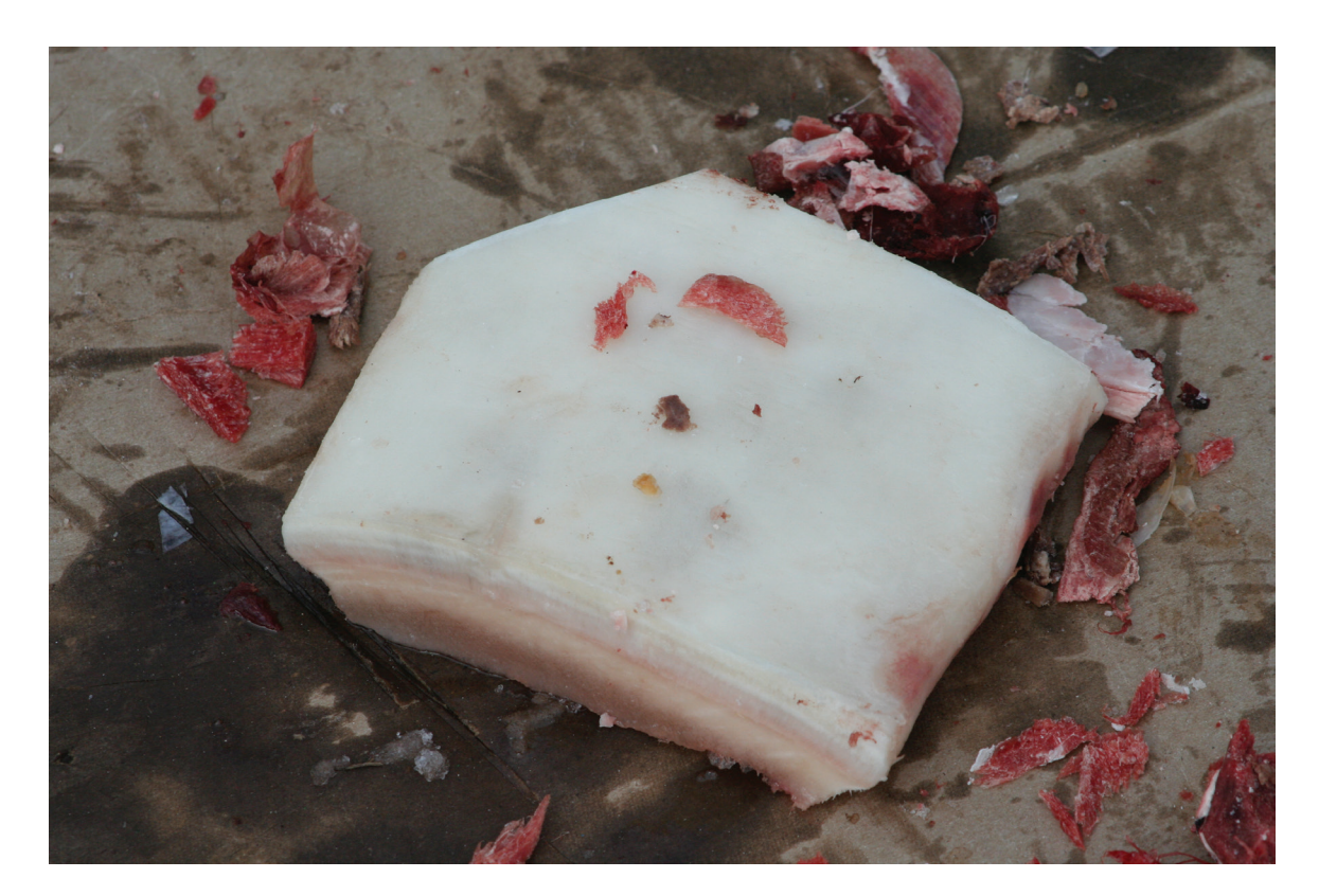
Figure 3: Mamattuk (Delicious) (2012), digital photograph. For Inuit, whale bubbler (mattaaq/utsuk) is healthy and delicious, a superfood if you will, that continues to sustain Inuit life and culture, and at times it is considered a real delicacy when received. This image depicts country food at a traditional Inuit feast. Country food is very important to Inuit, and the Foodland Security series is about access to country food by Inuit in an urban setting. It is also about creating and elevating urban Inuit art photography to a high art form.