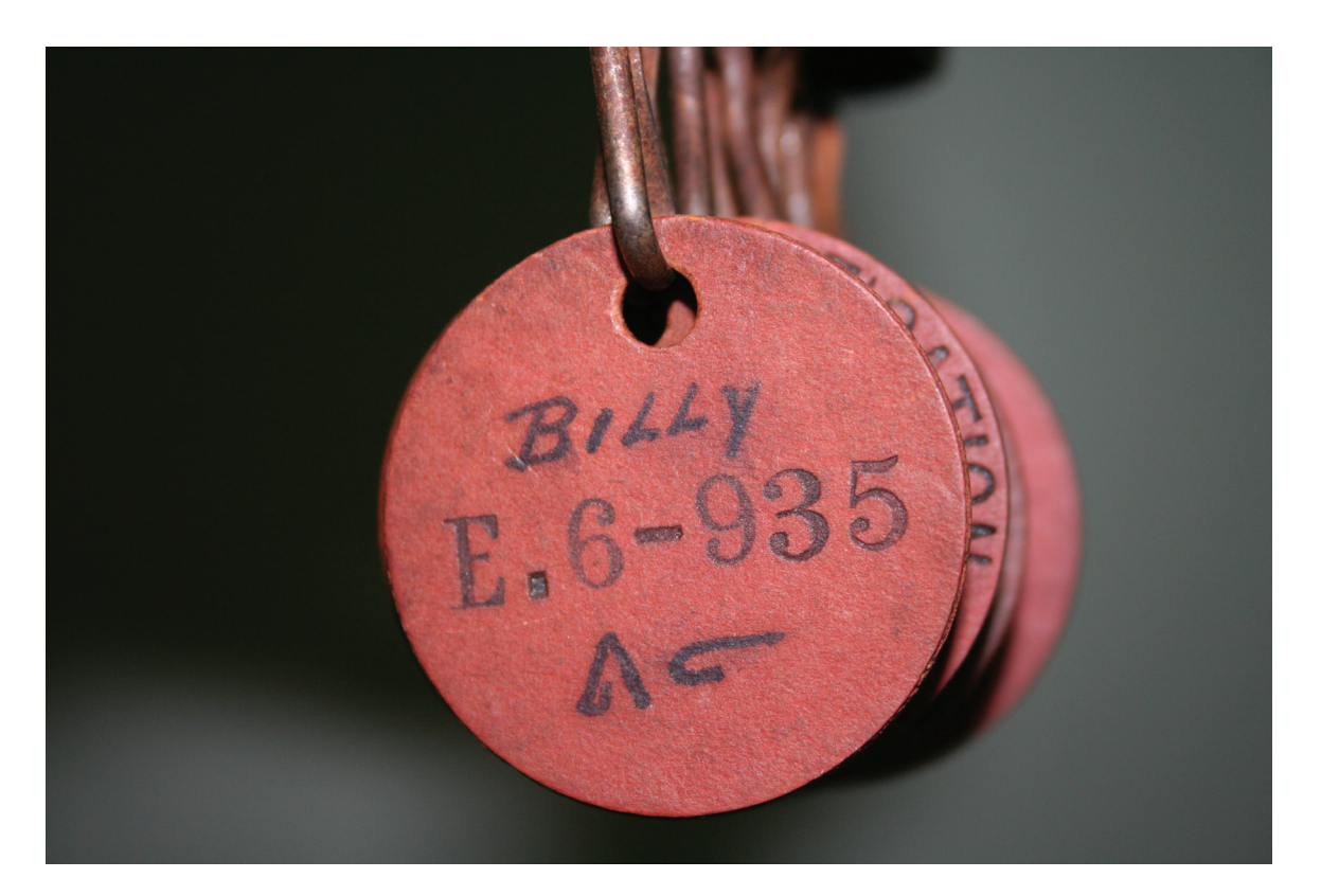
Figure 5: Awareness 2 (2012), digital photograph. This series of photographs brings an awareness to a subject that is not known within Canadian mainstream society. The Eskimo Identification Program was developed by the Canadian government in the 1940s (and operated until the late 1970s/early '80s) as a way of identifying Inuit using numbers.