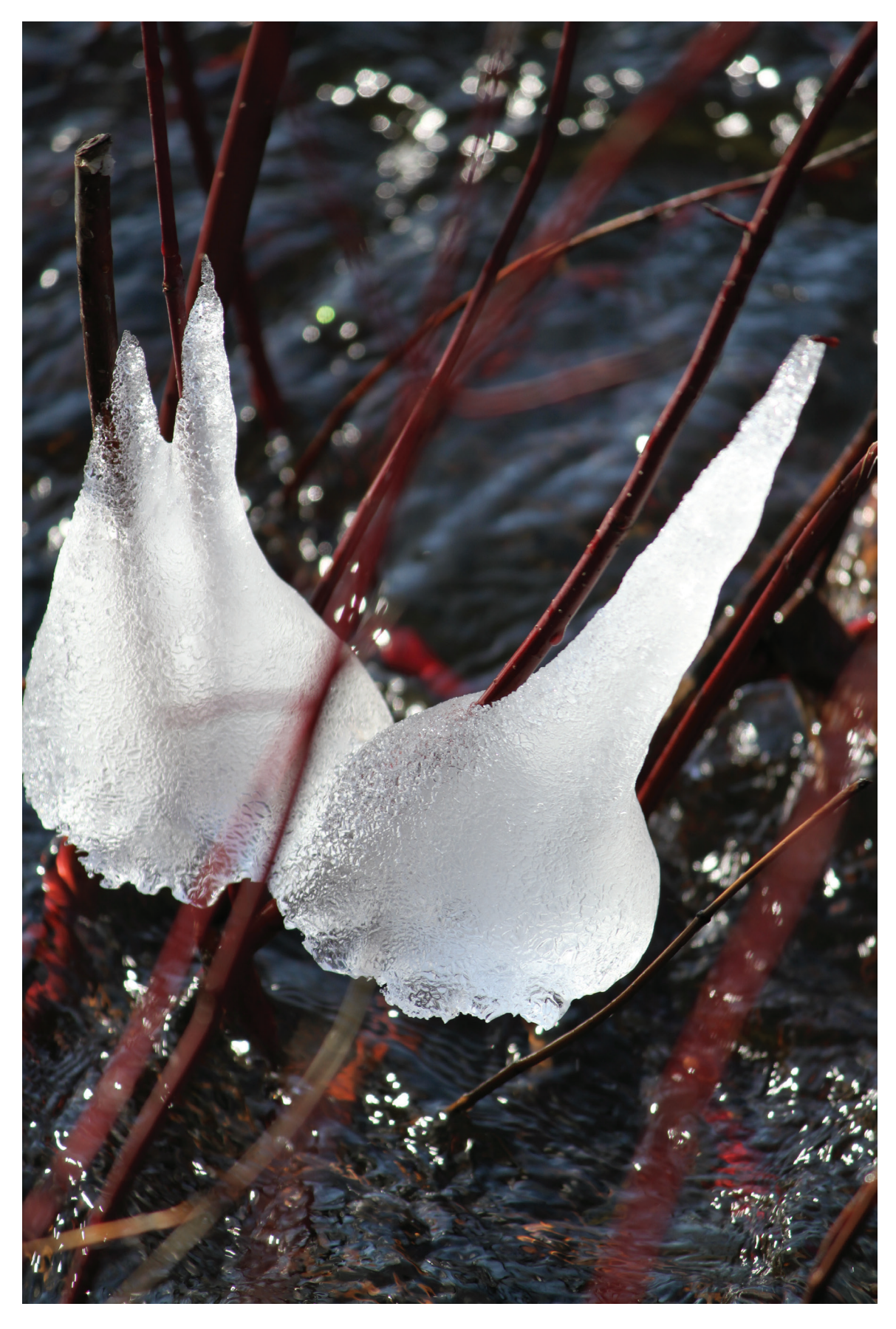
Figure 6: Where Are You Now Brigitte Bardot? (2008), digital photograph. Climate change and global warming are real and happening now. Inuit regions and the Arctic are melting. I question where are all people, where are their voices and uproar about climate change and its effect on Inuit and global communities. Where are the Brigitte Bardots when we need them? Photo © 2021 Barry Pottle. All rights reserved.