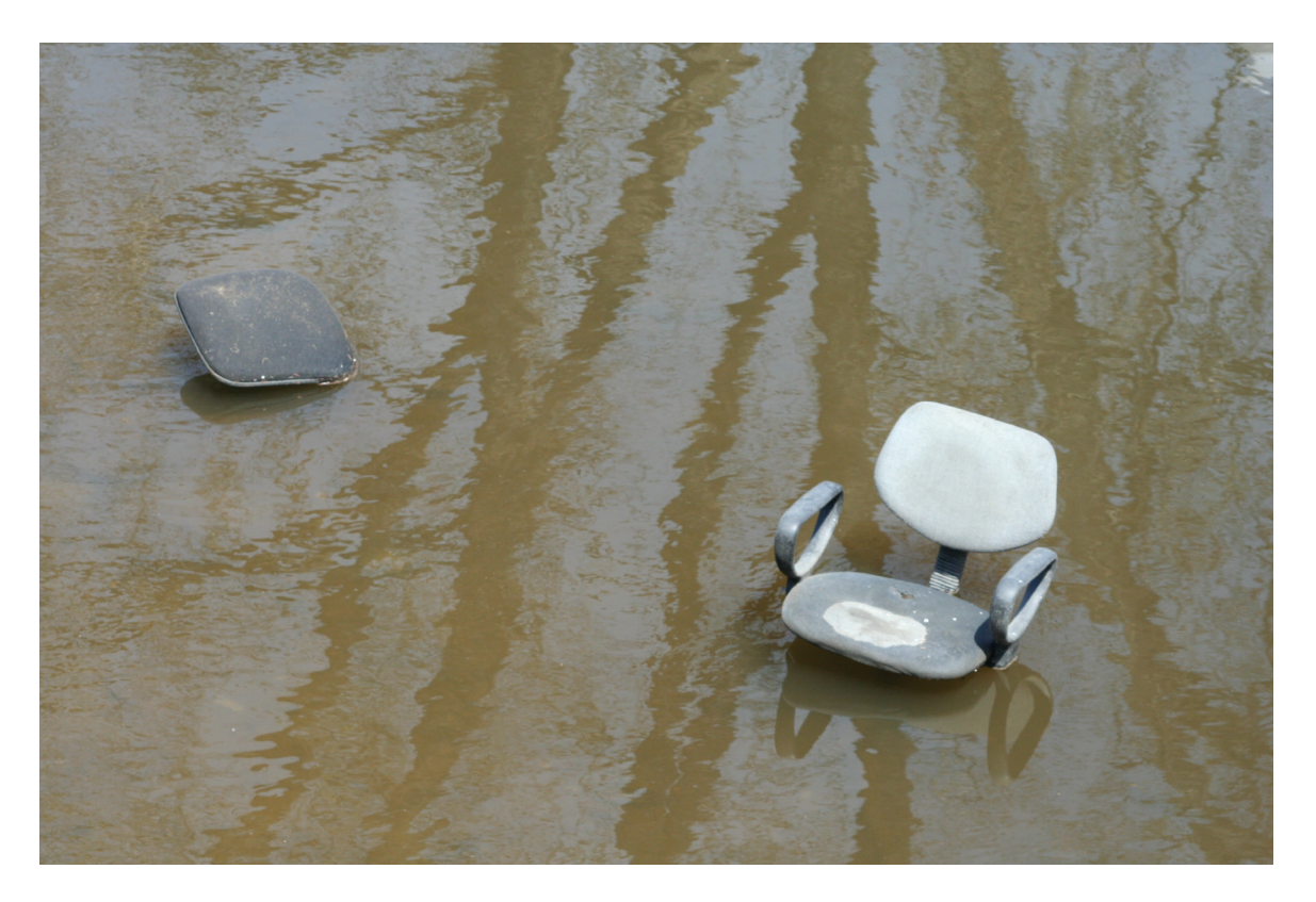
Figure 7: Policy Gone Awry (2008), digital photograph. This picture speaks to climate change within the urban perspective. If we do not combat the changes to climate then we are in serious trouble. In this work I am asking us to consider the policies and programs for climate change that are in front of us. If we do not develop strong policies and implement them to fight climate change then the results will be devastating.

Andrea: As a photographer who produces digital images, do you have a process for working post-production in preparation for printing photographs?