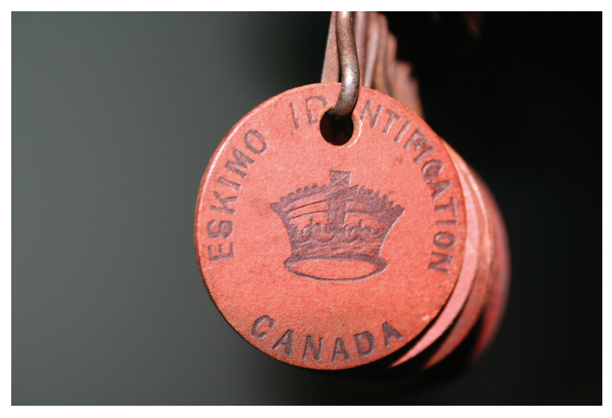
Figure 4: Awareness 1 (2012), digital photograph. Photo © 2021 Barry Pottle. All rights reserved.