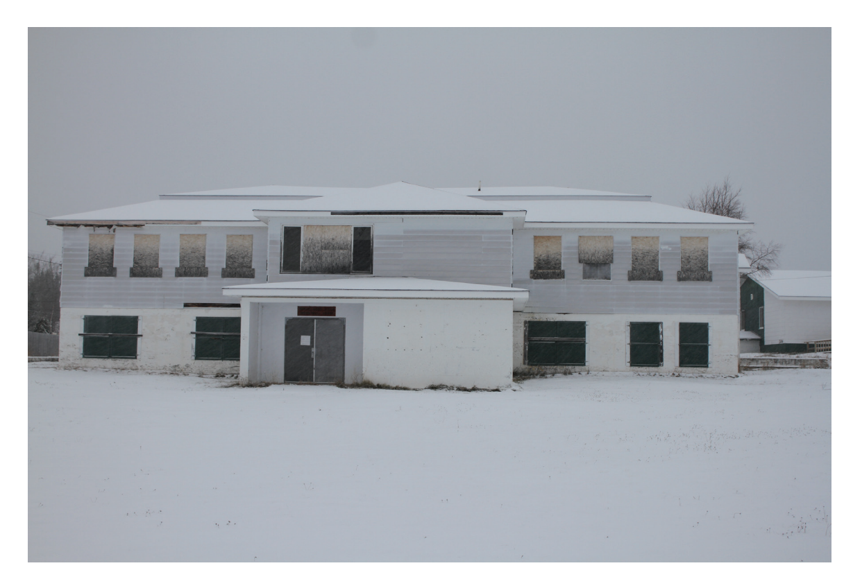
Figure 11: Yale Dormitory (Residential School) North West River Labrador (2015), digital photograph. I spent five years (1970–75) at Yale Dorm. There were residential schools in Newfoundland and Labrador. To kill the Indian in the child applied to Inuit as well. I took this photo in 2015, knowing that I may not see this place again.