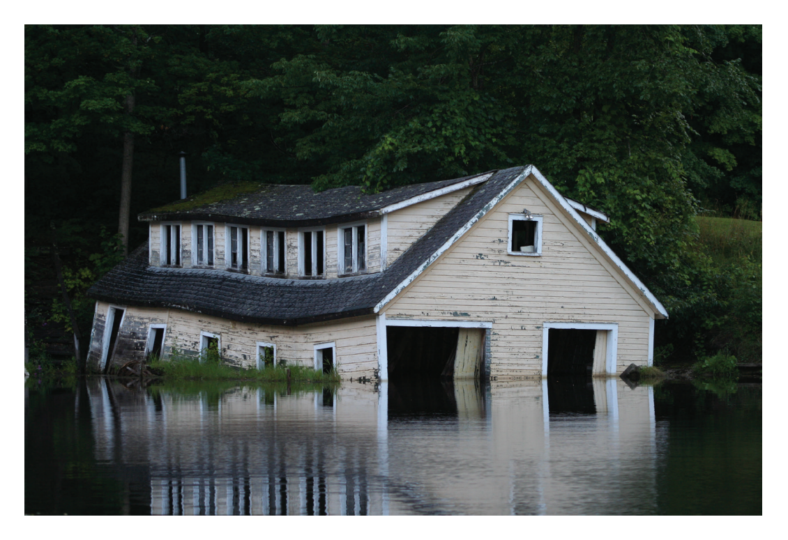
Figure 8: Watertown Memories (2013), digital photograph. This image was taken at Brown's Marina on Indian Lake, Ontario. The building reminded me of back home in Labrador; travelling by boat brought back memories of being in boats and on the land. I think it was the stillness of the image that stirred up those memories. This building is now up on land with the intent of it being restored by the owner.