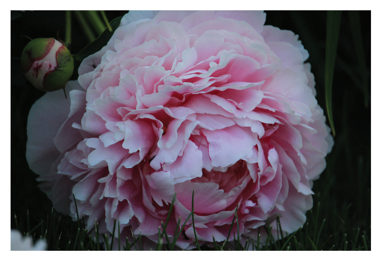
Figure 13: Beginning of Botany Boy Pottle (2019), digital photograph. In this photograph I am experimenting with the limits of what can be considered an Inuit art photograph. My interests in subject matter are varied; with Botany Boy I am exploring the theme of botany. How might this work in relation to my other photographs and practice? These recent pictures of flowers make me ask myself when and where and what does botany mean to me as an artist.