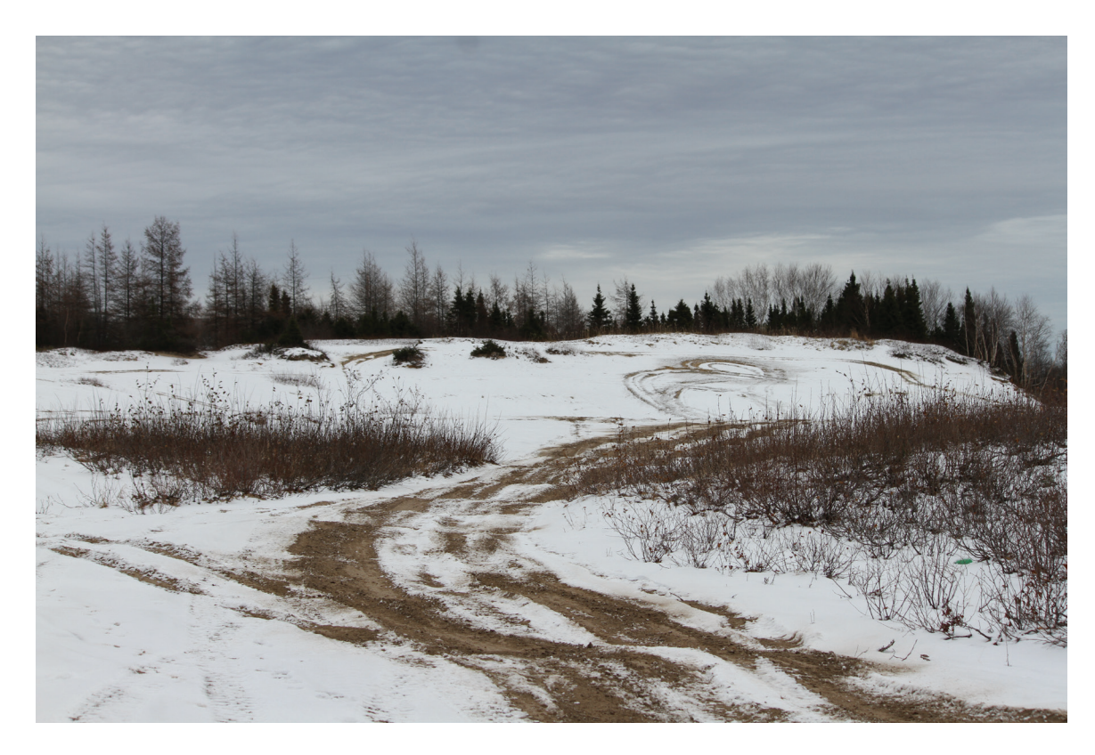
Figure 12: Johnny Hill, Happy Valley-Goose Bay (2015), digital photograph. This is the street (Cabot) where we moved after relocating from Rigolet to Happy Valley-Goose Bay in 1967. Johnny Hill was our childhood playground. We played, fought, had fun, and explored the area. It is basically a sand hill.