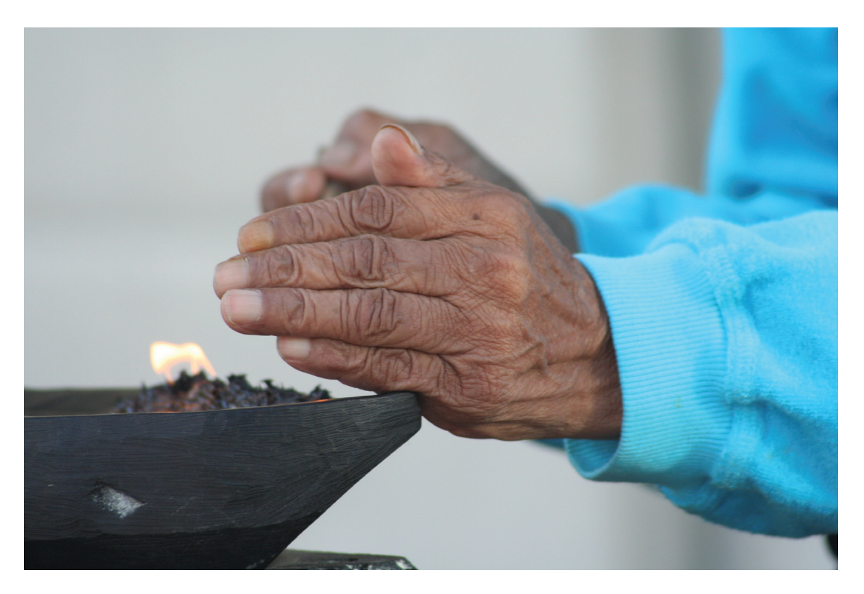
Figure 2: Cultural Teachings. Larga Baffin Opening (2009), digital photograph. This image was taken at the opening of Larga Baffin Residence in 2009. The Elder was teaching about the meaning and usages (traditional and contemporary) of the Qulliq (traditional Inuit seal oil lamp). Traditionally it was used for cooking, heating, and drying cloth.

Andrea: What effect has your photography had on audiences outside of your home territory?