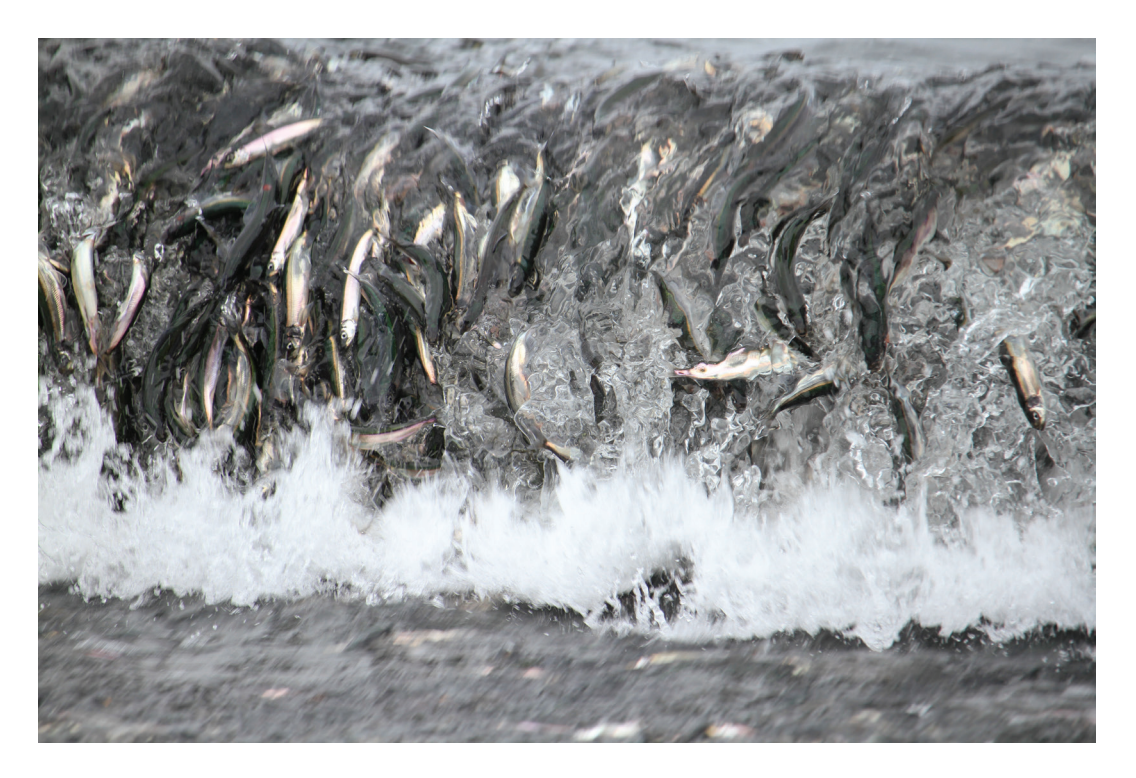
Figure 9: Capelin Roll, Middle Cove, NL (2018), digital photograph. The Capelin roll is an annual event in Newfoundland; it is when the Capelin come in to spawn and lay their eggs. The Capelin roll is a cultural activity as well. Everyone comes to get their fill of Capelin for food, and the Capelin is also gathered to use as fertilizer on gardens. People from all around come to partake in the Capelin roll. It has evolved into a cultural and community event and at times a tourist activity. Here I wanted to see if I could get an image of them actually rolling.