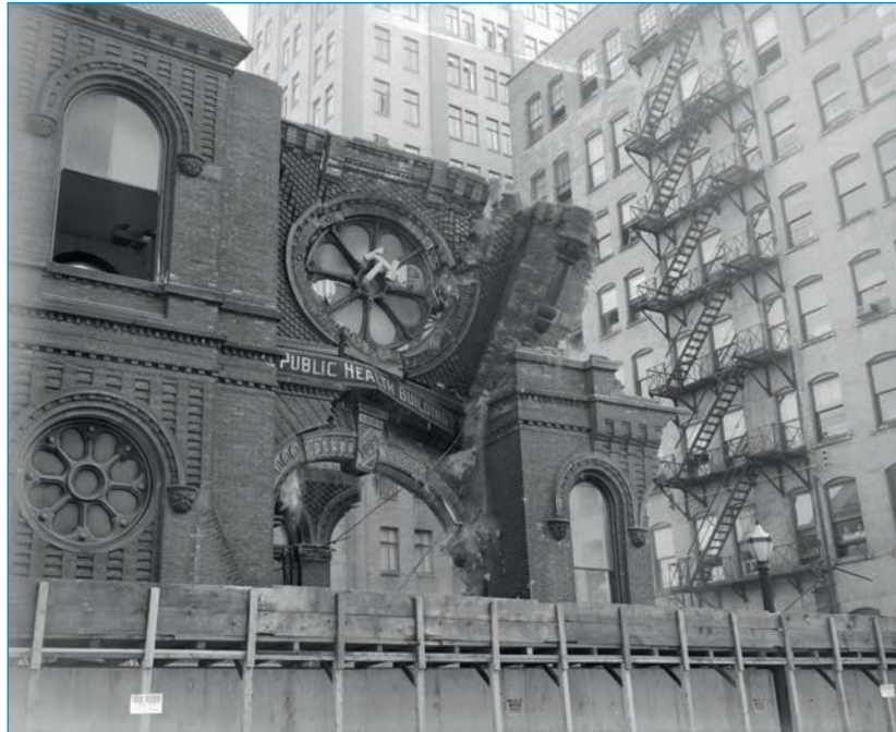
FIG. 1. A PHOTOGRAPH DOCUMENTING THE DEMOLITION OF THE PROVINCIALY SIGNIFICANT, FIRST HAMILTON PUBLIC LIBRARY, HAMILTON, ON, 1955.