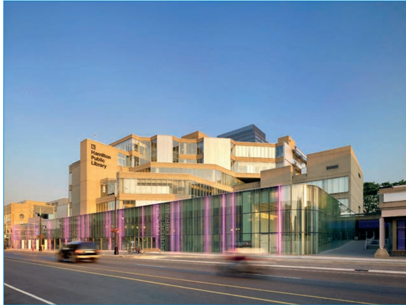
FIG. 12. CENTRAL LIBRARY & FARMERS' MARKET SEEN FROM YORK BOULEVARD, HAMILTON, ON, 2011, BY DPAI WITH RDH. COURTESY OF DPAI.