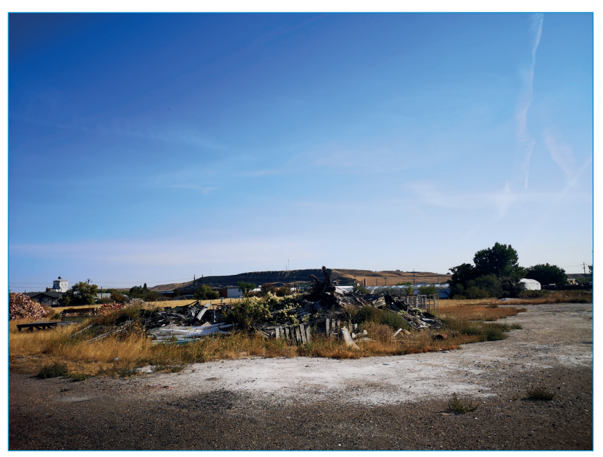
FIG. 6. PILES OF DISCARDED BUILDING MATERIALS ON PREVIOUS SITES OF THE CLAY INDUSTRY IN MEDICINE HAT, SEPTEMBER 2022.