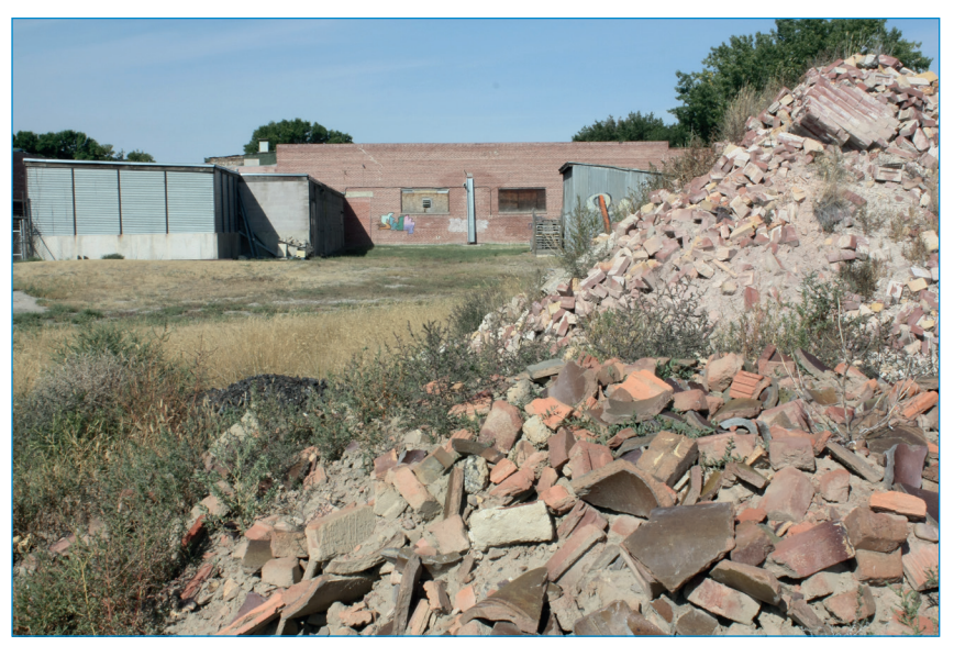
FIG. 8. ABANDONED HYCROFT POTTERIES LIMITED GROUNDS; NOTICE THE DISCARDED CLAY POTS, WALL FRAGMENTS, AND BUILDING MATERIALS, SEPTEMBER 2022. SAJAD SOLEYMANI.

red brick. As Deborah Cowen writes, "The CPR was not simply important – it is understood to have built the nation in terms of the material connections it forged across the continent, but also because it was the very condition for the Canadian confederation." The CPR and the clay industry as such underpinned the colonial dispossession of the Cypress Hills.