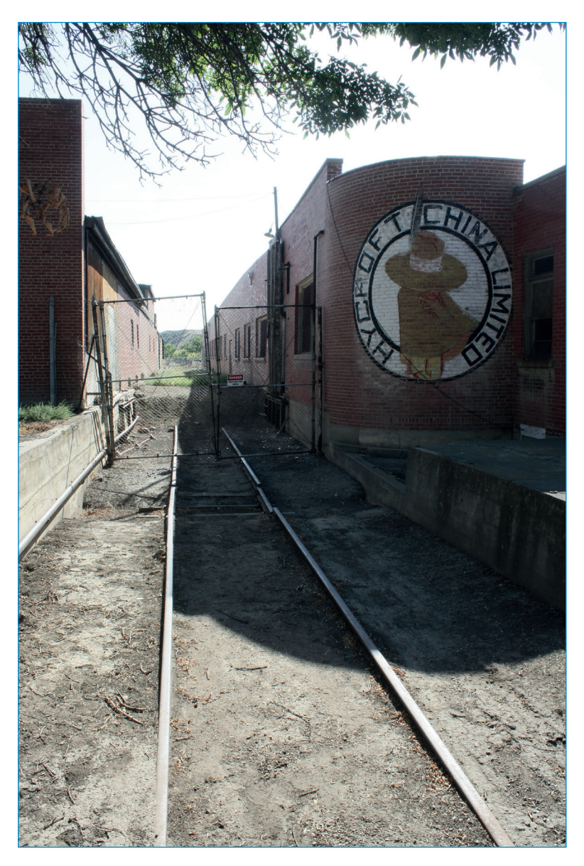
FIG. 9. ABANDONED HYCROFT POTTERIES LIMITED GROUNDS; NOTICE THE RAILROAD PREVIOUSLY PASSING THROUGH THE FACTORY GROUNDS, SEPTEMBER 2022. SAJAD SOLEYMANI.