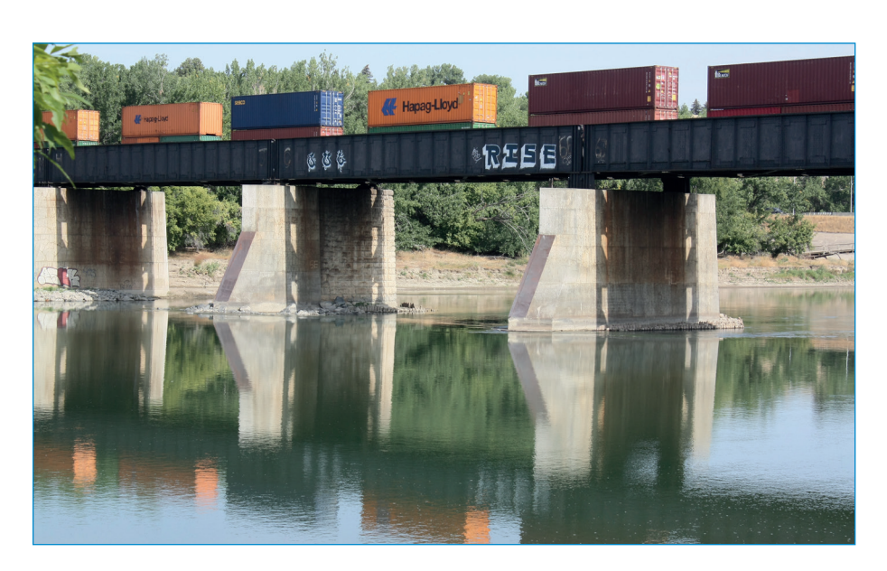
FIG. 2. SOUTH SASKATCHEWAN RIVER AND THE CANADIAN PACIFIC RAILWAY IN MEDICINE HAT, SEPTEMBER 2022.

Known by its colonial name Medicine Hat,<sup>5</sup> an adaptation of the Blackfoot word Saamis , the city is in the southeastern part of the province of Alberta, close to the border with Montana. It is home to the Blackfoot, Cree, Assiniboine, and Métis Peoples.<sup>6</sup> With a population of 65,203, Medicine Hat is the sixth largest city in Alberta and the 89<sup>th</sup> largest in Canada.<sup>7</sup> It was incorporated as a city in 1906, a year after Alberta became a province, and it was at the time the largest city in southeastern Alberta. Known as the Gas City, Medicine Hat was founded and became prosperous in part due to the discovery of extensive gas wells during the first years of the twentieth century. The discovery was accidental; the Canadian Pacific Railway (CPR) was looking for water while building a bridge across the southern tributary of kisiskâciwanisîpiy, or the South Saskatchewan River, when their drilling hit one of the largest gas fields in North America (figs. 2 and 3).<sup>8</sup>