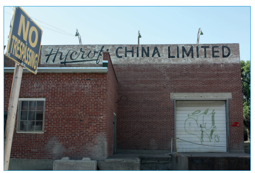
FIG. 12. "NO TRESPASSING" SIGN AT THE NORTHEAST ENTRANCE OF THE ABANDONED HYCROFT POTTERIES LIMITED FACTORY, SEPTEMBER 2022.