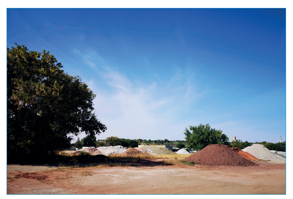
FIG. 4. PILES OF CLAY IN ABANDONED POTTERIES ACROSS MEDICINE HAT, SEPTEMBER 2022. BANAFSHEH MOHAMMADI.

Access to abundant, cheap natural resources, connection to the Canadian Pacific Railway, and low tax rates contributed to the swift flourishing of Medicine Hat as a military and industrial hub.9 In addition to the extensive gas fields, another natural resource that supported the urban development of the city was Medicine Hat's high-quality clay (fig. 4) that was extracted from a region to the south known as the Cypress Hills.<sup>10</sup> Cheap gas and high-quality clay were the chief reasons for the establishment and prosperity of ceramic and brick manufacturing as the main industry in colonial Medicine Hat.<sup>11</sup> The city's clay industry, which began as early as the 1910s, was on the rise until the late 1960s. By the late 1980s, a combination of global competition and disastrous floods led to the closure of most of Medicine Hat's clay manufacturers.<sup>12</sup> Remnants of pottery companies in the periphery of the city today are vestiges of that material and economic history (figs. 5 and 6).