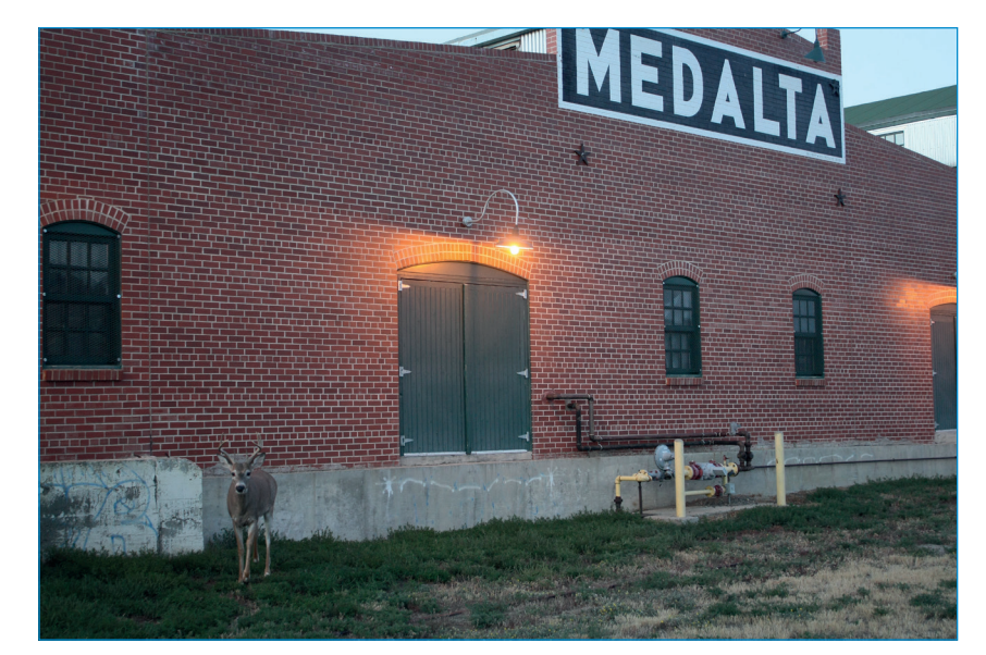
FIG. 11. WHITE-TAILED DEER ROAMING AROUND THE SOUTHERN FAÇADE OF THE FORMER MEDALTA POTTERIES LIMITED GROUNDS AND ALONG THE RAILROAD, SEPTEMBER 2022. SAJAD SOLEYMANI YAZDI.