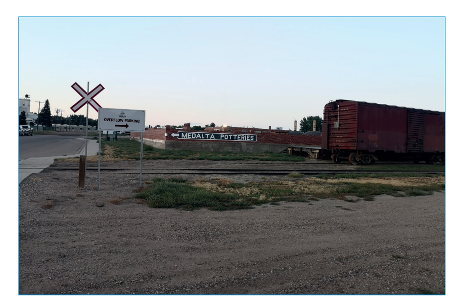
FIG. 7. A LOW WALL MARKING THE PREVIOUS BOUNDARY OF THE MEDALTA POTTERIES LIMITED (NOW MEDALTA MUSEUM) GROUNDS, SEPTEMBER 2022. BANAFSHEH MOHAMMADI.