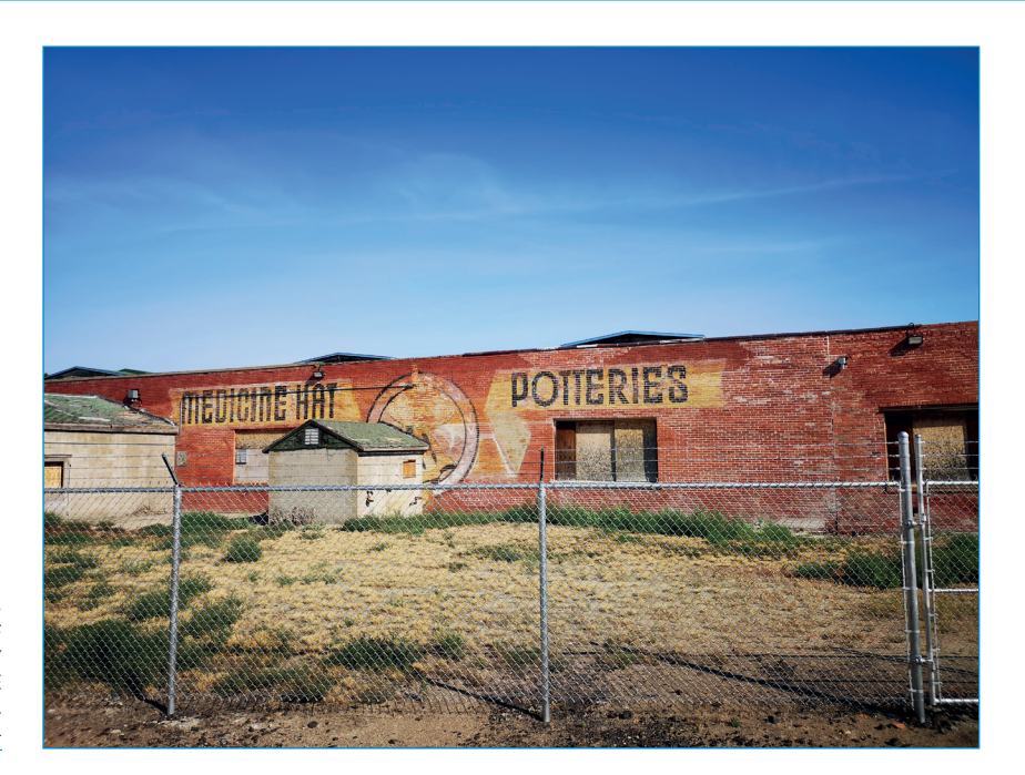
FIG. 5. FENCED-OFF WALL OF AN ABANDONED CLAY FACTORY IN MEDICINE HAT, SEPTEMBER 2022. BANAFSHEH MOHAMMADI.