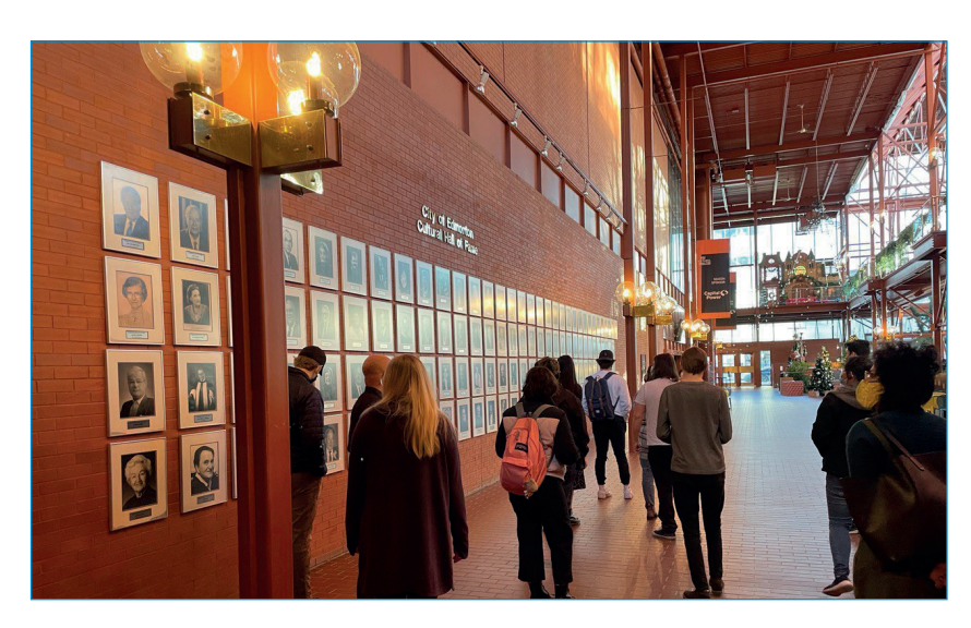
FIG. 1. MEDICINE HAT RED BRICK USED IN THE CITADEL THEATRE, FEBRUARY 2022.

To trace this colour, I travelled 527 kilometres south from Edmonton to Medicine Hat to see the land that produces this rich red construction material. The questions I asked were: What do architectural materials do? Do they keep traces of the history of their making/makers? Can the story of their violence be carried through the years in the form of materials such