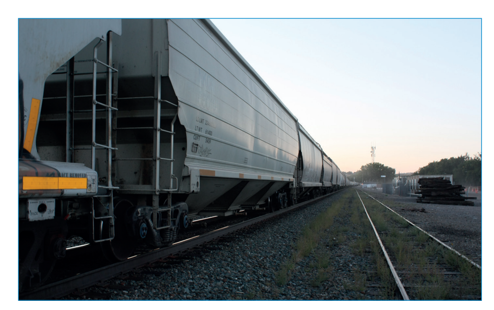
FIG. 3. THE CANADIAN PACIFIC RAILWAY IN MEDICINE HAT, SEPTEMBER 2022. SAJAD SOLEYMANI YAZDI