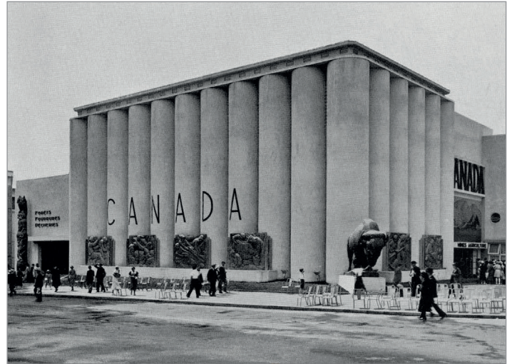
FIG. 6. CANADIAN PAVILION, 1937 WORLD'S FAIR, PARIS, FRANCE. | ÉMILE BRUNET. FROM JOURNAL, ROYAL ARCHITECTURAL INSTITUTE OF CANADA , VOL. 14, NO. 10, OCTOBER 1937, P. 203.

a comparatively few individuals seem to be given to religion, some form other than the Gothic cathedral must be found. Industry concerns the greatest numbers—it may be true, as has been said, that our factories are our substitute for religious expression. 15