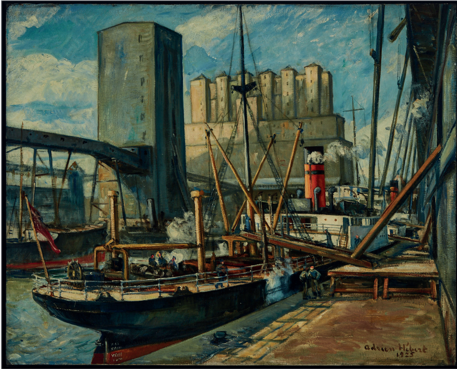
FIG. 4. ADRIEN HÉBERT, MONTREAL HARBOUR , 1925, OIL ON CANVAS, 81.3 X 101.6 CM. | PRIVATE COLLECTION.

male figure clothed in a longshoreman's coat and cap, ready for work with his lunchbox in one hand (subtly monogrammed with a MB) and a longshoreman's hook atop his other shoulder. 12 Behind the man is a middle ground filled with masses of similarly capped workers, pickup trucks going in all directions, and a billowing steam engine with a throng of boxcars. In the background are a series of ships (a tanker, tugboat, and a huge passenger liner) and a geometric concrete terminal grain elevator with its repetitive cylindrical silos.