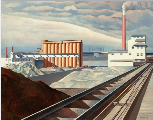
FIG. 5. CHARLES SHEELER, CLASSIC LANDSCAPE , 1931, OIL ON CANVAS, 63.5 X 81.9 CM. | BARNEY A. EBSWORTH COLLECTION, NATIONAL GALLERY OF ART, WASHINGTON, DC.