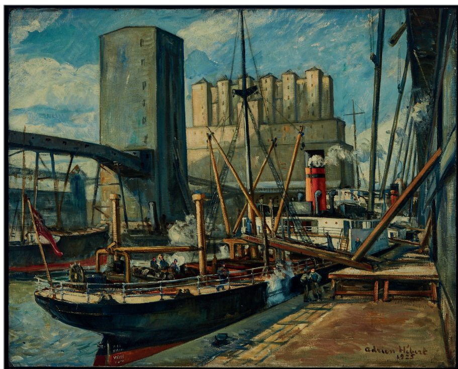
FIG. 4. ADRIEN HÉBERT, MONTREAL HARBOUR , 1925, OIL ON CANVAS, 81.3 X 101.6 CM. | PRIVATE COLLECTION.

male figure clothed in a longshoreman's coat and cap, ready for work with his lunchbox in one hand (subtly monogrammed with a MB) and a longshoreman's hook atop his other shoulder. 12 Behind the man is a middle ground filled with masses of similarly capped workers, pickup trucks going in all directions, and a billowing steam engine with a throng of boxcars. In the background are a series of ships (a tanker, tugboat, and a huge passenger liner) and a geometric concrete terminal grain elevator with its repetitive cylindrical silos.