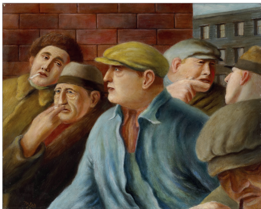
FIG. 2. MILLER BRITTAIN, LONGSHOREMEN , 1940, OIL ON MASONITE, 50.8 X 63.4 CM. | COLLECTION OF THE NATIONAL GALLERY OF CANADA, OTTAWA, PURCHASED IN 1970.