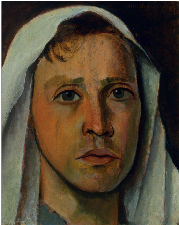
FIG. 1. JACK HUMPHREY, DRAPED HEAD, 1931, OIL ON PANEL, 42.5 X 34.5 CM, GIFT OF THE GRADUATING YEAR, 1937. | HART HOUSE COLLECTION HH1937.002.