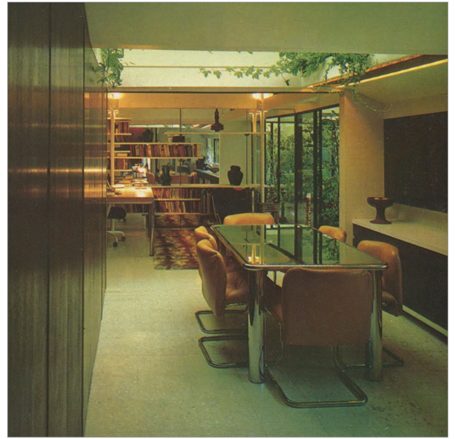
FIG. 6. DINING SPACE.