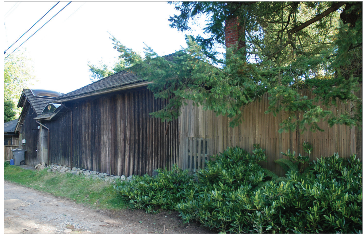
FIG. 8. VIEW FROM THE BACK LANE, 2018.

require a home, merely a pied-à-terre from which to briefly touch base between world travels. In numerous interviews Erickson dismissed his home as merely "a place to camp," as his "real home [was] in the world."62 The modest quality of the home had Erickson describing how pleased he was that "this place [was] so convenient, because [he could] shut it and leave." 63 He explained how his frenetic professional schedule had created a strong sense of restlessness: "I find that about every fourth day or so I become impatient and it's time to move along."64 He claimed that he had not stayed more than ten consecutive days in place since 1965.65 One journalist stated, in 1985: "It is possible, given his legendary jet-setting