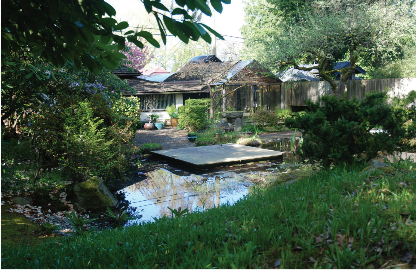
FIG. 7. VIEW FROM THE BACK GARDEN, 2018. | CHRISTINA GRAY.

cultivated social sphere. The bon vivant Erickson was described in a local paper as someone who "appears as predictably in the society columns as canapés at the soirees he frequents."54 The house parties grew legendary through retellings, often featuring well-known guests such as Prime Minister Pierre Elliott Trudeau.55 Newspapers reported stories of anthropologist Margaret Mead reading to spellbound attendees at one event. Journalists similarly detailed another party in 1967 for the London Royal Ballet where Rudolf Nureyev danced around Erickson's pond, which had been specially filled with black swans, before jumping into the water in the buff for some inspired skinny dipping.<sup>56</sup> Illuminated by Japanese paper