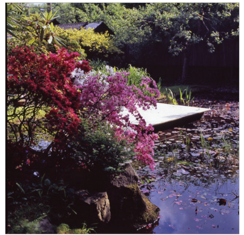
FIG. 2. POND WITH MOON-VIEWING PLATFORM. | SIMON SCOTT.

established norms or instead the belief that architecture emerged as an exceptional phenomenon that remade the rules around itself. This unresolved tension, in turn, reflected Erickson's uneasy engagement with his own position within the late modernist movement, a movement searching to relocate architectural creativity and authority. These issues lurk behind the longstanding intrigue that has surrounded Erickson's own home.