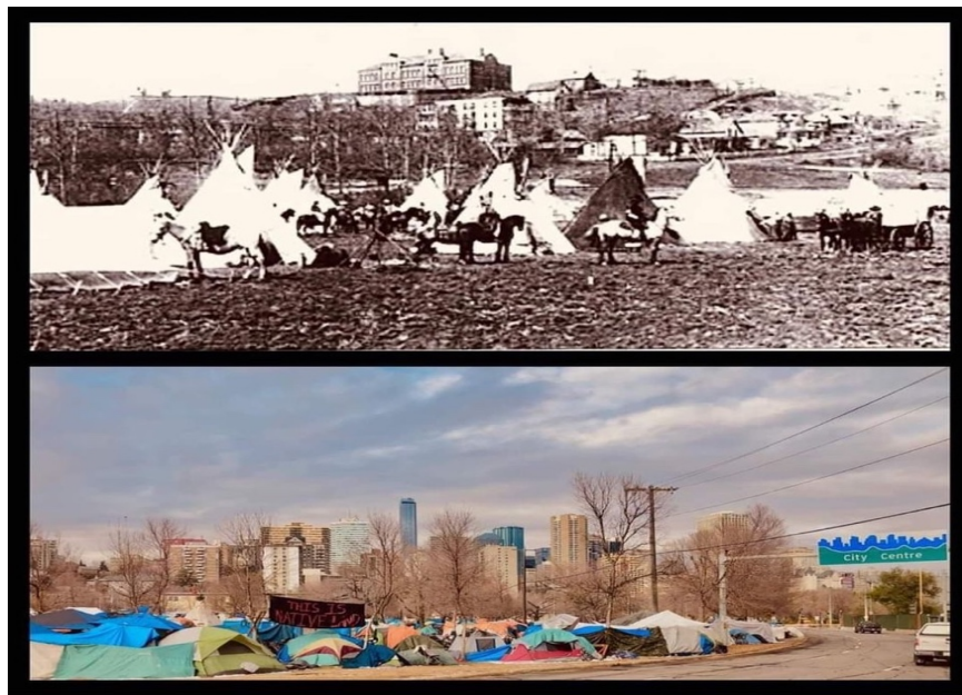
Figure 1: Indians’ encampment on Rosssdale Flats at foot of McKay Avenue School in Edmonton circa early 1900s.

Note (circa 1900s). Edmonton Maps Heritage.