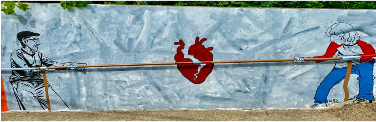
Figure 2: Castlegar street art.

Todd (2015) writes that “pedagogical spaces can be seen as sites of liminality, or threshold spaces, whereby the self undergoes a process of change occasioned by what lies in-between what one knows and what is utterly strange” (p. 55). Todd’s idea of liminal/threshold space provides a way in for me. To my way of thinking it represents the bridge between here and there. Change is hard. Being asked to change is hard. Insisting that we see, think, and do differently in a space that is knowable, comfortable, and familiar will create a shattering and instill fear. And yes, we need to know that it’s okay to be unsettled, afraid, and undone at times. Uncertainty is, after all, a precondition of living, but to live well wouldn’t it be nice to have something to lean on, to hang onto, or to stand upon?