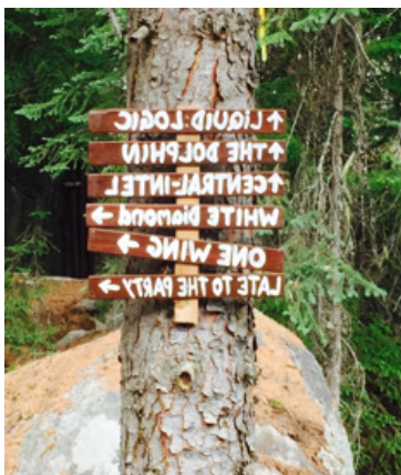
Figure 1. Disorientation.