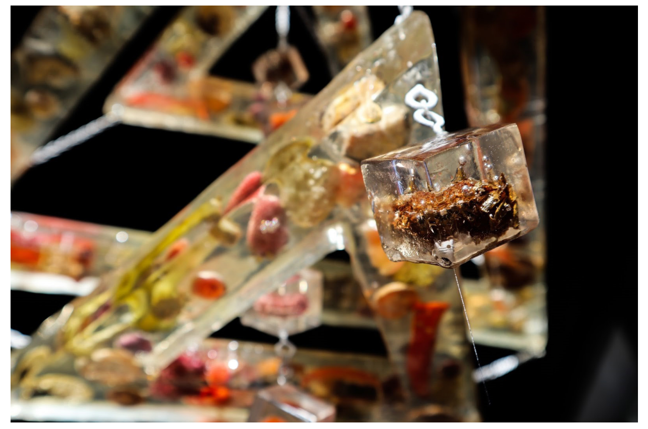
Figure 4. A liquifying chandelier.

The reality of this dining room is that there was no actual food served at the Exhibit. One of the focal pieces of the Exhibit, the food-waste chandelier centrepiece that consistently leaked from the inside out (Figure 4) and came crashing down twice during installation, posed relentless interruptions to set and reset our table. Revisiting the food-waste chandelier now, over two years since the Exhibit, we learn it has continued to decay, with the resin activating a syrupy mess. While we may have left the Exhibit on the very cusp of COVID-19, the Exhibit's mattering has not left us; the work of (de)composition keeps going. This consistency suggests the ongoing work and responsibility of the connoisseur to notice a world already tempered and "ticklish" in movement beyond human reason (Stengers, 2015), a connoisseur who works with multiple bodies and relational palates in which indigestion is the overt destabilizing reminder, offering bitter clues and more questions at a table we may not yet know.