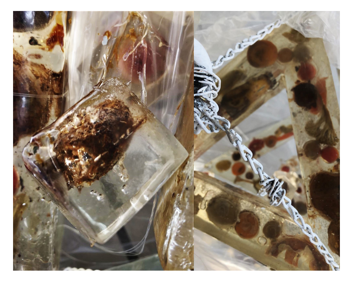
Figure 5. Untitled.

Plastic-wrapped in the basement, food-waste-resin stories live long after dinner. Tasting them now, displaced/ replaced across hemispheres—in and out of capitalist rhythms. Small chain-links move with unease—lethargic in the pull as syrupy insides drizzle through and across metal loops (Figure 5). Extending them long, small flakes of white, acrylic paint fall, sticking to fingertips and clinging under nails. The chandelier is slippery, sluggish as its accordion layers expand outward, sticky to what comes near. Still inside but leaking through, food-waste bodies are dissolving with each other and beyond the boundaries of resin skin. It is difficult to mark their forms. The view is blurry, rotting juice crystals tacked with mix-matched pieces of paper and plastic. Coming from the inside out. Residue lingers in mouth, the aftertaste is tart, the flavour uncertain. Bruises are slow to swallow. We percolate in this inhospitable moment when instinct calls to spit. How does climate catastrophe taste?