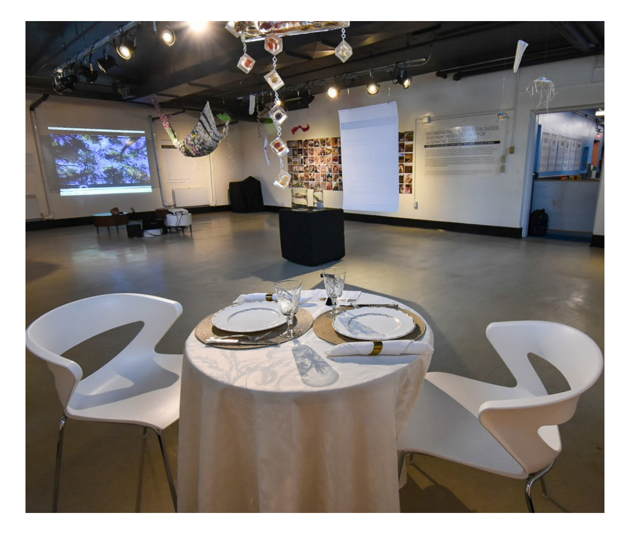
Figure 2. Setting the table.