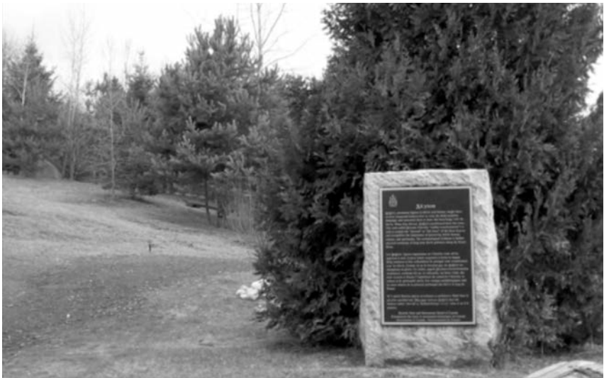
Figure 2. Parks Canada plaque at Xá:ytem. The swóxwiyám is presented first in English, then French, and lastly in Halq'eméylem.