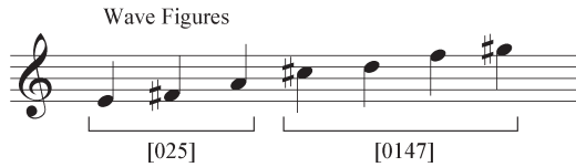
Example 4: Wave-like figures in section IV (choir 1)

particular texture featuring rhythmic counterpoint: at the beginning of page 30, the first choir chromatically fills A to C-sharp, then A to C at the end of page 31. Finally, as the climax of the piece approaches (beginning at 33), an even smaller major second-wide cluster in both choirs gradually contracts to B-flat, its point of symmetry. Example 5 summarizes this gradual cluster contraction from a tritone to a unison B-flat just before the climax of section V. The only voice to skirt this trend and effectively create its own musical layer is the seventh voice.