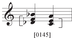
Example 3: Oscillating minor triads in section III

The end of section III centres again on the B-flat minor chord, this time in oscillation with the A minor chord a semitone lower. As illustrated in example 3, the combination of these two chords generates the [0145] cell that is important to melody 2. The musical processes that govern the end of this section will be discussed in detail below.