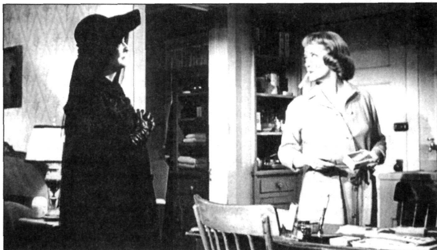
Figure 2: Dead Ringer (Bette Davis) 4

acts. Often, Previn arranges this music as “swirling” and active, but an early instance also inscribes a somewhat more plaintive variation in order to suggest the modest nature of Edie’s apartment. Later in the film, he also begins to use the “gothic” harpsichord music for the disclosure of details about Maggie’s own complicated life. Thus, the meaning of the opening title’s music arguably has much less to do with what Edie knows she’s getting into (i.e., killing her sister) than with what she doesn’t know about (i.e., her sister’s similar criminal past).