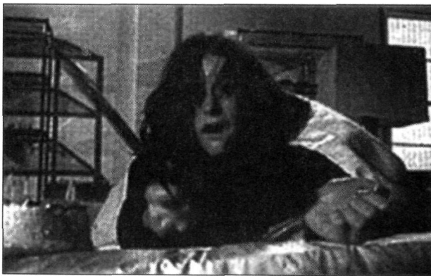
Figure 3: Sisters (Margot Kidder) 7