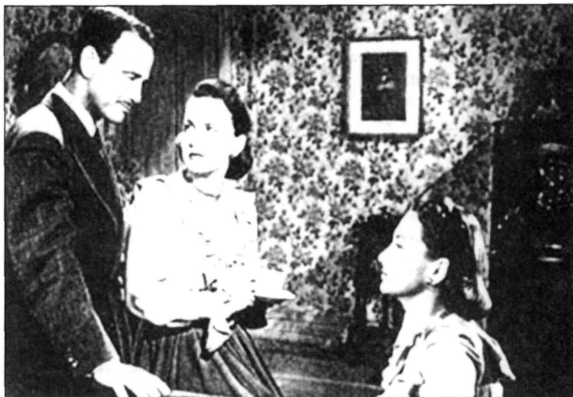
Figure 1: The Dark Mirror (Lew Ayres and Olivia de Havilland) 2 Name-necklaces, lighting, and facial expressions help to identify the kind vs. psychotic twins.

to get away with such a “perfect crime,” and he follows this up by convincing a psychologist who studies twins, Dr. Scott Elliott (portrayed by Lew Ayres), to add Ruth and Terry into his case load. As Stevenson makes the suggestion to Dr. Elliott that the desperate murderer might try to kill her own sister, hints of Tiomkin’s titles music appear. In the same scene, romantic orchestral music also reveals that Scott has more than just professional interests in mind for Ruth, as he had already been flirting with her in the twins’ former job as an attendant at his medical building’s newsstand. He ends up falling in love with Ruth, which should at least make us question his subsequent potential for objective research (see Figure 1). Then, towards the end of the film, he nearly becomes the latest victim of Terry’s psychosis.