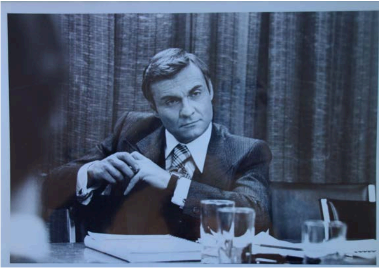
Figure 5: Kenneth Welsh as Peter Lougheed in The Tar Sands , 1977.

would react to the show, he replied “I suspect both of them are going to go through the roof” (Waters 1977, A23). Perhaps unsurprisingly, with his political leanings, Hurtig stood behind the show, commenting “It is a very accurate reflection of the process of bargaining that occurred over the Syncrude plant” (Calgary Herald 1977, A1) and went as far to say that the CBC had “performed a remarkable public service and has, in fact, been very courageous. It (the show) was unique, one of a kind. They’ll never put on anything as tough” (Toronto Star 1977, A69).