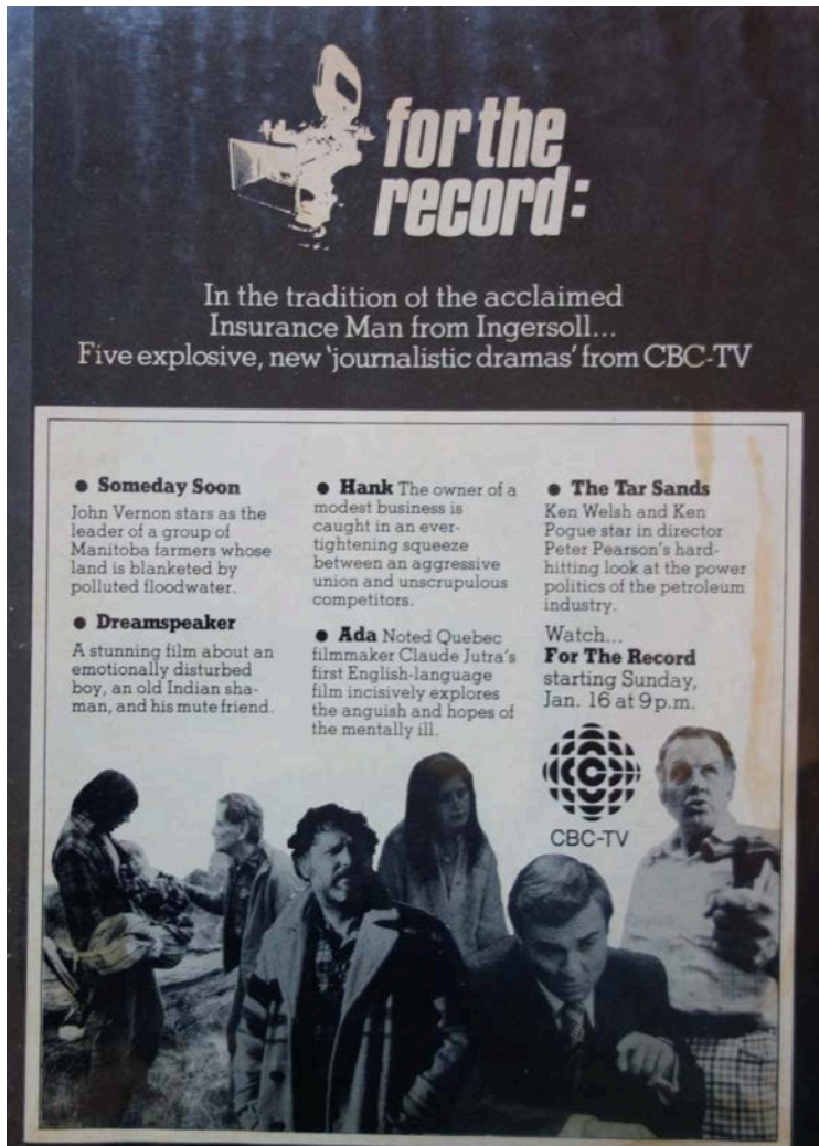
Figure 2: For the Record Advertisement, 1977

myths, Roland Barthes reminds us, make history seem natural, yet their creation “is constituted by the loss of the historical quality of things: in it, things lose the memory that they once were made of”